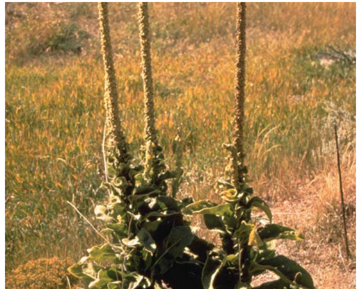
mullien ( Verbascum thapsus )

Invasive exotic plants have been consistently ranked as a top vital sign for long term monitoring as part of the NPS Inventory & Monitoring (I&M) Program. During final selection of SOPN vital signs in 2006, invasive exotic plant monitoring was recognized across all network parks as the most important shared monitoring need. Early detection is a key strategy for successful invasive exotic plant management. Therefore, the SOPN has incorporated the following objectives into its monitoring plan for Exotic Plants: (1) to detect the initial occurrence for any of a subset of high priority species in areas of high and low invasion probability, (2) to determine changes in the status and trend (density, abundance or extent) of a subset of high priority species in areas of high and low invasion probability, and (3) to determine changes in species composition of a subset of high priority species in areas of high and low invasion probability, taking into account any management treat-