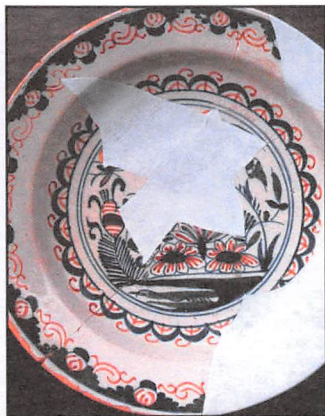
1700s delft dish on display in the museum.