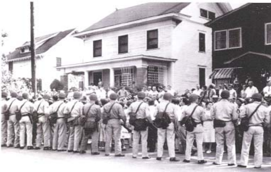
The Arkansas National Guard standing watch on Park Street in front of Little Rock Central High School, September 1957.

The Capital Citizens Council issued a statement in mid-1957 that supported segregation: “The Negroes have ample and fine schools here and there is no need for this problem except to satisfy the aims of a few white and Negro revolutionaries in the local Urban League and the National Association for the Advancement of Colored People.”