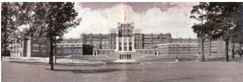
Little Rock Senior (Central) High School, 1927.

Unconstitutional: not constitutional; not according to, or consistent with, the terms of a constitution of government; contrary to the constitution.