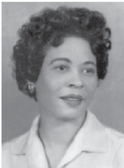
Daisy Bates, mentor to the Little Rock Nine during the crisis of 1957.

Outside of the school, black journalists who covered the story were harassed and physically attacked. They ran from the mob and took refuge elsewhere in Little Rock. President Eisenhower was “disgusted” when he heard about the rioting and ordered in federal troops to contain the chaos. Over 1,000 members of the U.S. Army’s 101 st Airborne Division (“Screaming Eagles”) from Fort Campbell, Kentucky, came to Little Rock. The Arkansas National Guard troops at the school were then placed under their command. Observing the soldiers, activist and mentor to the nine students, Daisy Gatson Bates commented that “any time it takes eleven thousand five hundred soldiers to assure nine Negro children their constitutional rights in a democratic society, I can’t be happy.”