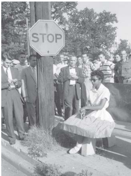
Elizabeth Eckford waiting for the bus on the morning of September 4, 1957 while an angry mob surrounds her. Top photo: Governor Orval Faubus, 1957.

Local business leaders, who had called for peaceful compliance with court orders for school integration, were met with resistance. For instance, the Mother’s League sought through the court system to have the federal troops removed from Central High School on the grounds that it violated federal and state constitutions (the action was dismissed) and Governor Faubus issued statements expressing his desire that the nine students be removed from the school. Religious congregations of all faiths gathered to pray for a peaceful end to the conflict and the NAACP fought the validity of the Sovereignty Commission and the forced registration of certain membership lists and organizations. One of those fined for not registering as a member of the NAACP was Daisy Bates, mentor to the nine students, who was fined $100 for not complying with the State Sovereignty Commission regulations.