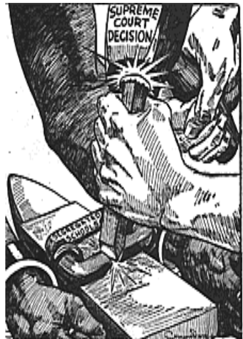
Cartoon from the Chicago Defender about the Brown v. Board of Education of Topeka , ca. 1954.

-United States Supreme Court, Brown v. Board of Education , 1954