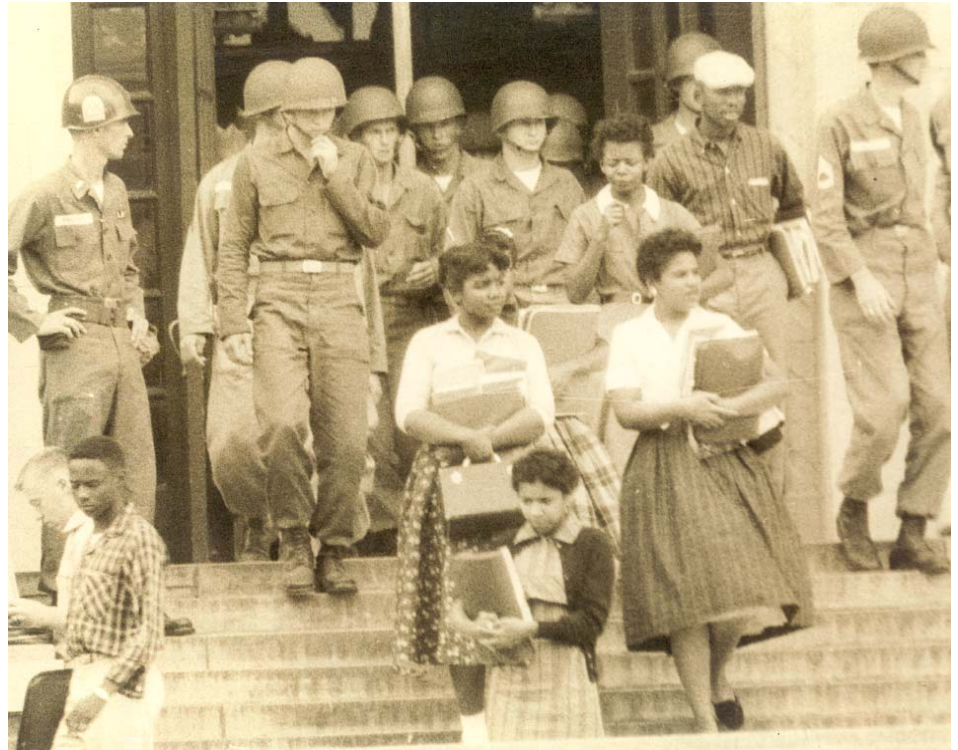
Several of the Little Rock Nine leave school accompanied by the Arkansas National Guard, 1957-1958.

As desegregation of Little Rock schools grew closer, the Arkansas State Legislature approved four "segregation bills" in early 1957. These bills created the State Sovereignty Committee (House Bill 322) to investigate those encouraging integration, removed the mandatory school attendance requirement at all integrated schools (HB 323), required the registration of certain individuals and organizations such as the NAACP (HB 324), and authorized school boards to use school funds to fight integration (HB325). In addition, the legislature also placed a three percent sales tax on the election ballot to ensure that more money would be spent toward education and fighting desegregation.