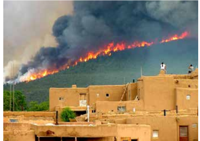
Taos Pueblo threatened by the 2003 Encebadito Fire