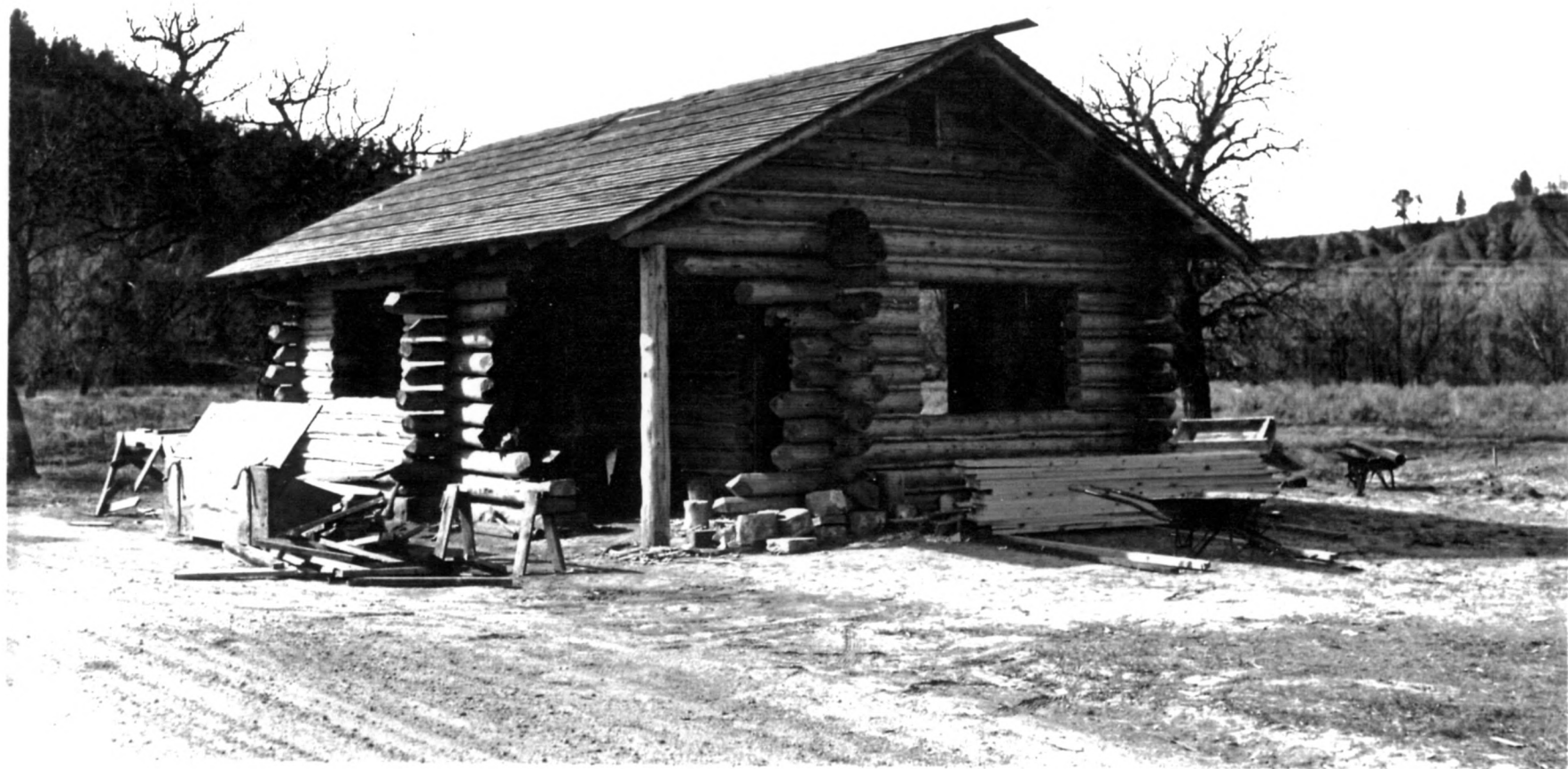
Entrance Station (HS-4), Devils Tower National Monument 1939 (monument archives)