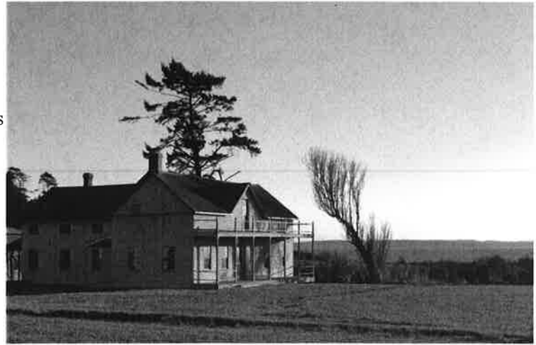
The Ferry House at Ebey's Landing as it looks today. The fragile house and surrounding fields are not open to the public at this time.

Today the evocative Ferry House sits isolated in a field, far away from town and commerce. Yet it still continues to speak to the present... and hopefully will do so long into the future.