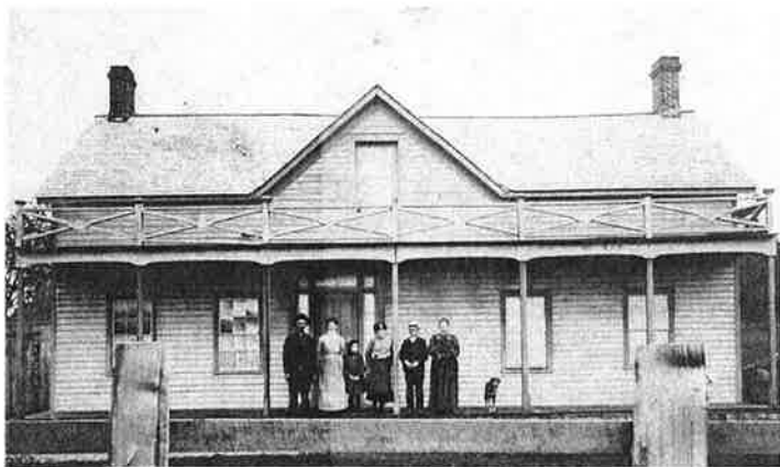
Ferry House, sometime prior to 1917