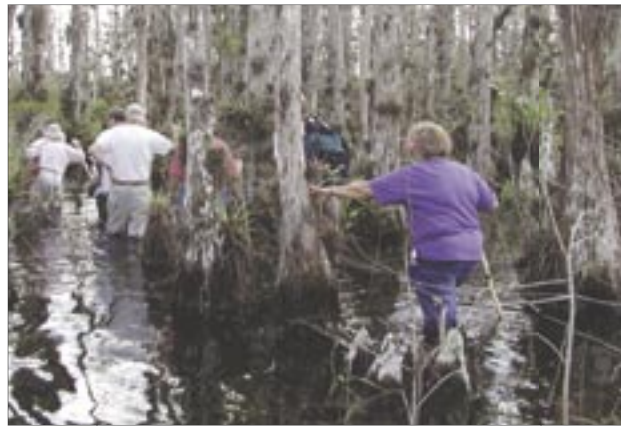
The Friends of Big Cypress National Preserve host an annual Labor Day Weekend swamp walk to encourage a deeper understanding of the preserve and the work of the National Park Service. To learn more about getting involved, check out their website or contact them by mail.

As a group, the members enjoy each other's company on swamp walks, hikes, canoe trips, camping trips and many other activities. They also join together to help the preserve in areas such as education, cleaning trails, repairs, art projects and more.