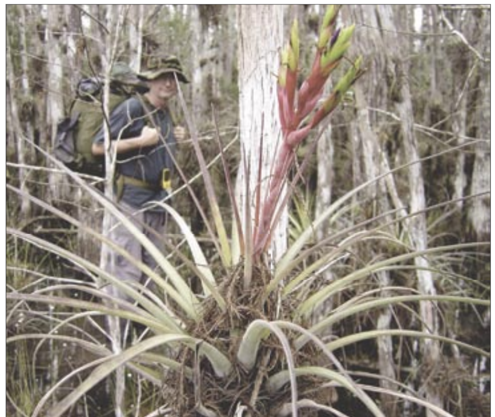
The author pauses for a moment while exploring the Big Cypress backcountry. The cardinal bromeliad in the foreground is a common sight in many areas of the preserve.

During our daytime travels, we flushed several wild turkeys and observed the distinctive white-flag tails of deer as they bounded across the prairies ahead of us. We saw only 3 snakes, a black racer and a small water snake, both of which are harmless and which quickly slithered off, as well as the venomous cottonmouth water moccasin mentioned earlier. The distinctive 45-degree tilt of the cottonmouth's head, as well as the black stripe running by the eye and alongside the head provided an instant positive identification. After observing it a short while, we snapped its photo, then left it to continue sunning while we went on our way. We kept watch, hoping to glimpse a rare Florida panther, of which only 80 - 100 remain. But these creatures are reputed to be shy and elusive. If they were present at all, they certainly lived up to their reputation, for we never saw so much as a panther track, much less a panther.