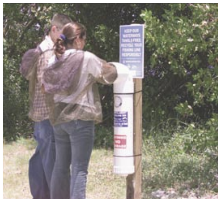
Monofilament recycling bins in Biscayne National Park help protect wildlife from accidental entanglement.

Biscayne National Park receives its share. One day last September maintenance employee Fred Torres collected a garbage can-sized bag of trash along one ten-foot stretch of mainland shoreline extending some 50 feet inland. A few moments with a pocket calculator revealed that enough trash to fill roughly 7400 bags litters the park's 14-mile mangrove shoreline. The ocean side of the islands, such as Elliott and