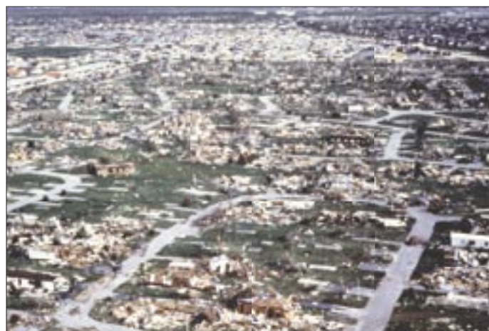
Left: Forests of South Florida have adapted to tropical storms and hurricanes over centuries. Tropical hardwood hammocks, pine, mangrove and cypress forests are cleared of dead and dying vegetation by the storms, which allows for new growth. Right: People have not adapted as well to the storms that sweep across the peninsula. It is difficult to say if future hurricane seasons will bring a greater number of storms, or perhaps storms of greater intensity.