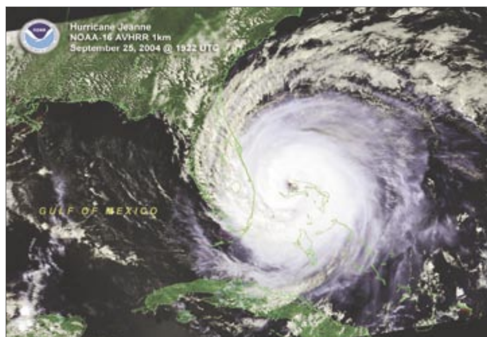
The hurricane season in Florida begins in June and goes through the end of November. These storms can be devastating on the human scale, destroying property and taking lives. In the natural world, the storms “just are” and have helped to shape South Florida into the place it is today.