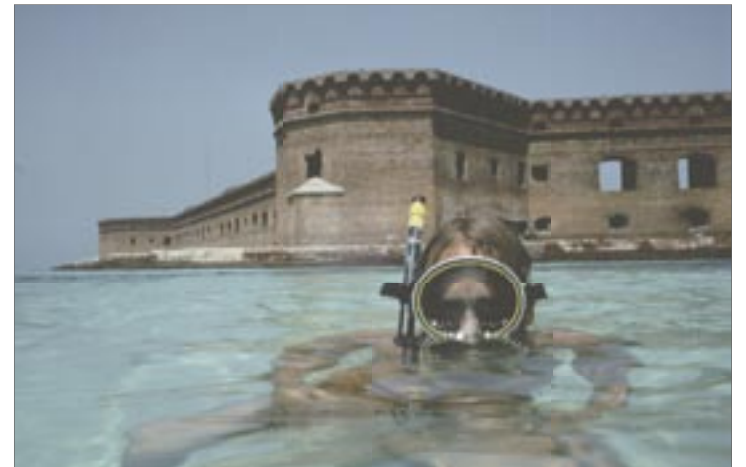
Once a formidable barrier deterring entry into the Gulf of Mexico by enemy ships, today the Fort serves as a centerpiece amid crystalline waters and protected coral reefs enjoyed by thousands of visitors each year.

Abandoned by the Army in 1874, the fort was later used as a coaling station for warships. In 1898, the USS Maine sailed into history, departing the Tortugas on its fateful mission to Havana, Cuba. Though used briefly during both world wars, the fort’s final chapter as “Gibraltar of the Gulf” had long since closed.