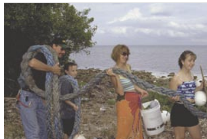
During the 2004 Biscayne Bay Cleanup 201 volunteers collected about 800 bags of trash in Biscayne National Park in four hours.

Old Rhodes Keys, is even more densely littered; it would be reasonable to double the above number of bags for the entire park.