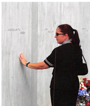
A marble wall engraved with the names of the 40 passengers and crew is built on the flight path. Chuck Wagner

Flight 93 National Memorial is a place to learn about the 40 passengers and crew of Flight 93 whose actions thwarted the hijackers' plan to fly this plane to a target in Washington, DC, most likely the US Capitol. It is a place to walk beside their final resting place and honor the extraordinary courage of those who fought back.