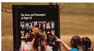
Young visitors explore the stories of Flight 93.