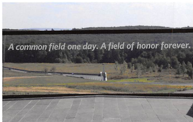
View of the Memorial Plaza at the Crash Site from the Flight Path Overlook at the Visitor Center. Brenda Schwartz

September 11, 2001, began as an ordinary, late summer day. But in less than two hours' time, this ordinary day was transformed as 19 terrorists boarded four airplanes, hijacked them, and used them to attack America. Nearly 3,000 people were killed when the hijacked planes were flown into the World Trade Center in New York City, the Pentagon near Washington, DC and when United Airlines Flight 93 crashed in the Pennsylvania countryside.