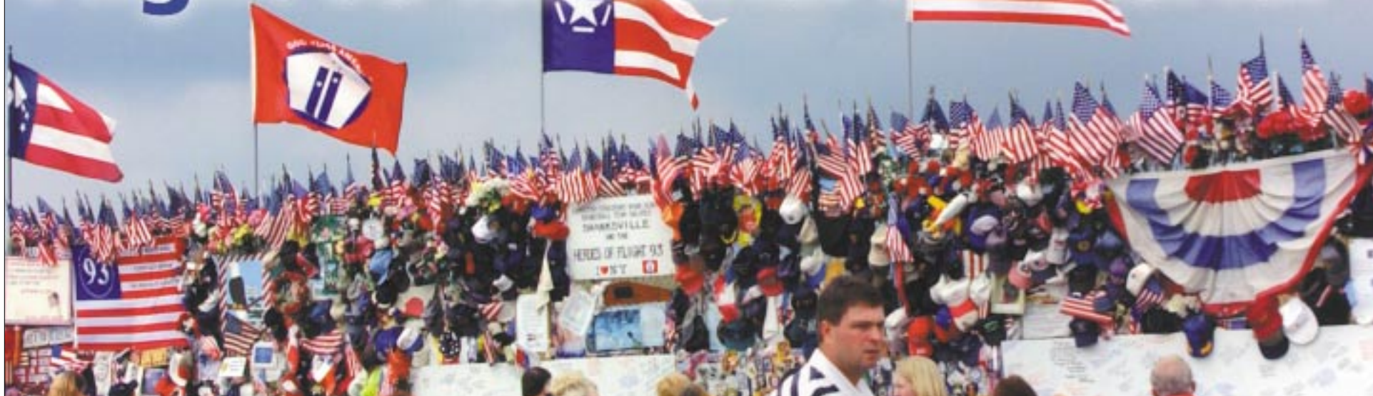
Flight 93 Temporary Memorial.