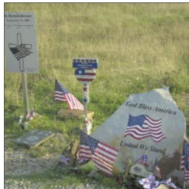
Tributes at the Temporary Memorial.