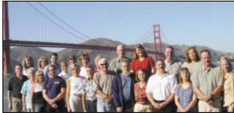
West Coast family workshop in San Francisco. Photo Credit: NPS, Oct. 2003.