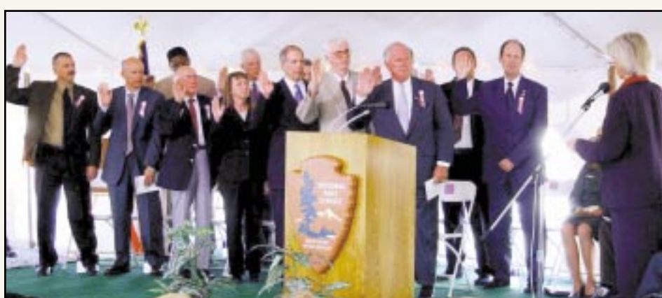
Secretary Gale Norton swears in Flight 93 Advisory Commission September 11, 2003.