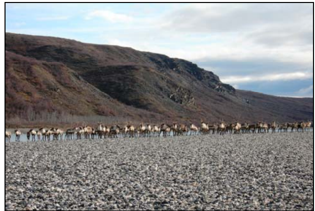
Caribou getting ready to cross the Noatak river, heading south in the fall.