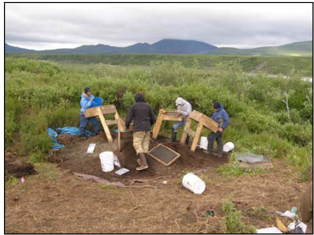
Archeological investigations in Noatak National Preserve during summer 2006.