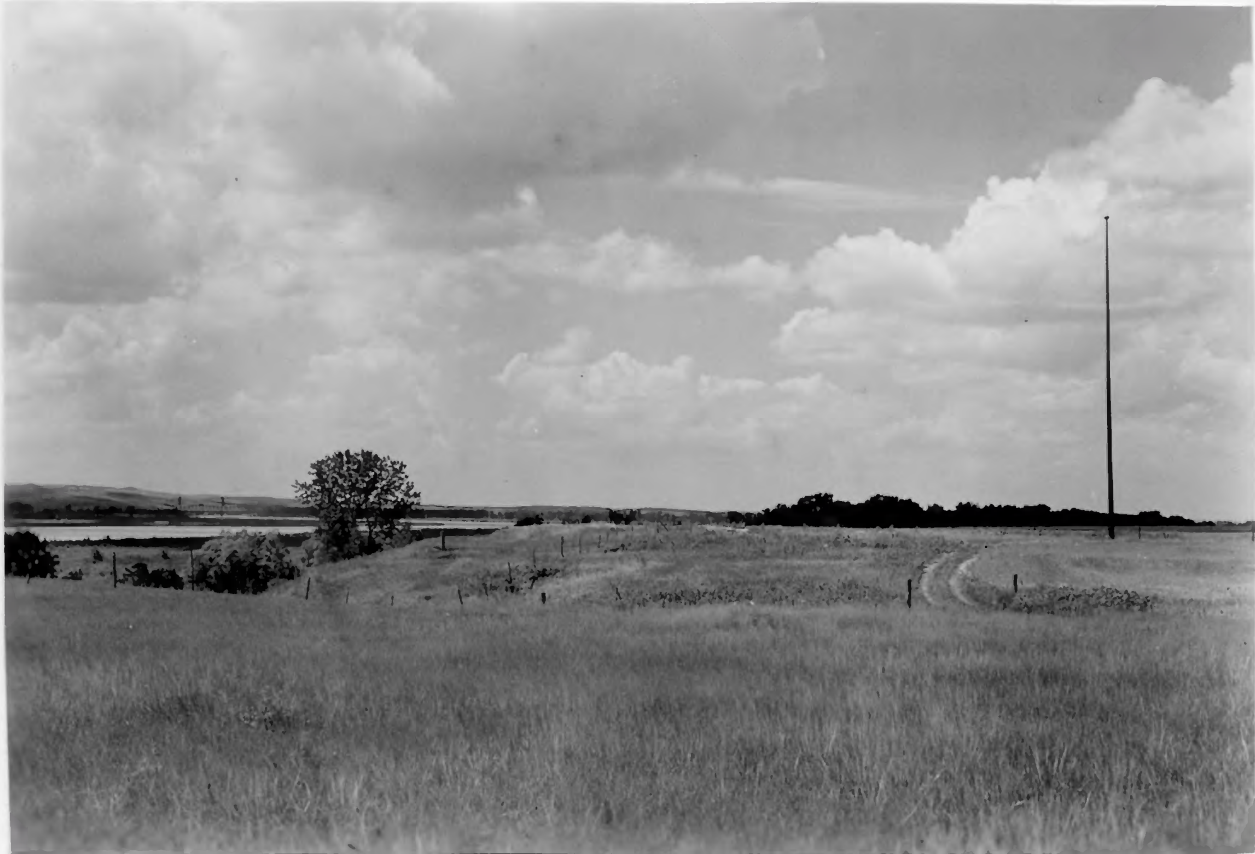
Site of Fort Union, North Dakota. For almost four decades this trading post was the principal fur trading establishment of the American Fur Company on the upper Missouri River. Camera pointing to the west.