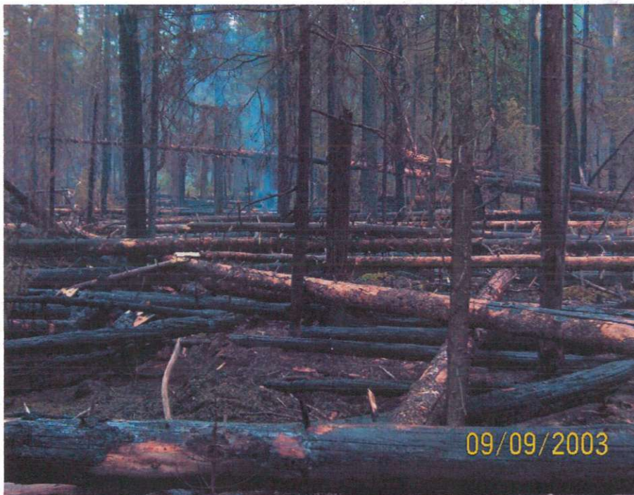
Burned trees of the Robert Fire fall to a new forest floor.

It is not difficult to see that fire changes an ecosystem. While some species are absent after a fire, many others are regenerated and become more plentiful. Fires perform not just one, but many different functions, because any given change has far-reaching effects throughout the rest of the system. Fires affect plants which impact herbivores and then carnivores.