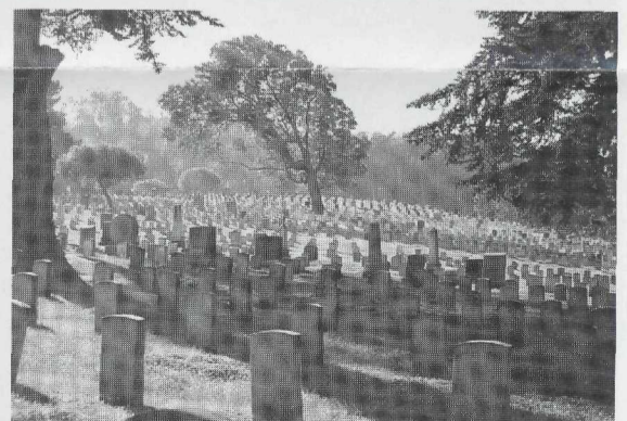
San Francisco National Cemetery.