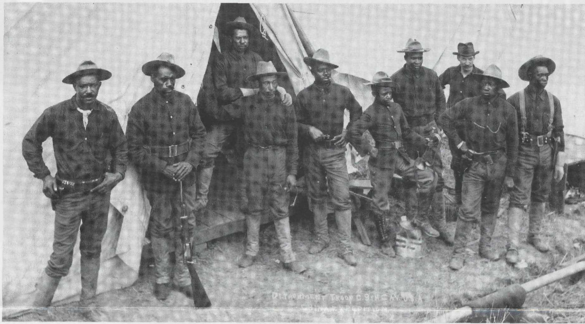
Troop C, 9th Cavalry at Camp Lawton, Seattle, 1900, preparing to embark to the Boxer Rebellion in China. The conflict in China was resolved before the company arrived, and Troop C was then diverted to the Philippine War.