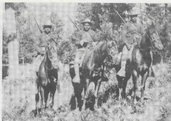
Members of the 24th Infantry on mounted patrol, Yosemite National Park, 1899.