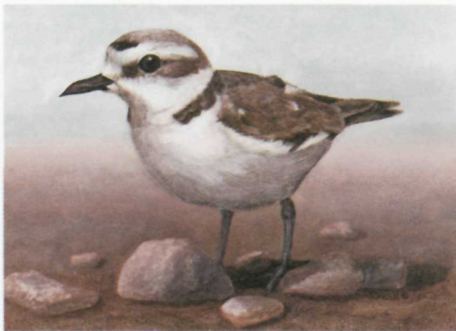
Western Snowy Plover

Remember, people, dogs, and wildlife can enjoy this park together if you follow these rules. Please do your part.