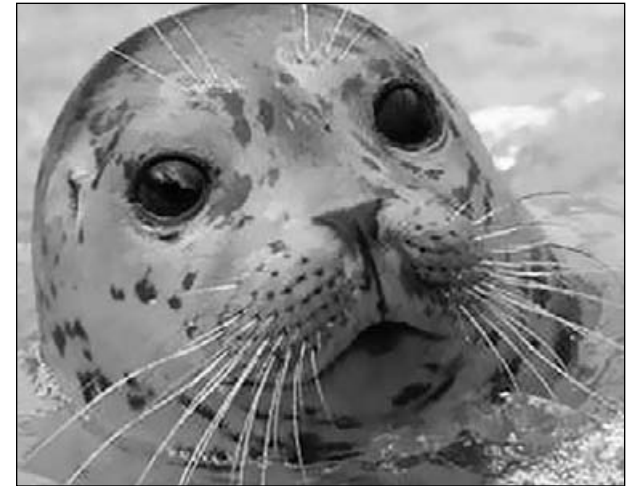
Harbor seals are among the many animals that frequent Horseshoe Cove.

Fort Baker is very different today from the time when the U.S. Army occupied the site. The U.S. Coast Guard moved to Horseshoe Cove in 1991 from its previous location near Fort Point in San Francisco. The Travis Air Force Base Sailing Center continues the tradition established by the army’s Presidio Yacht Club, providing sailing instructions, moorings and a club house. The Bay Area Discovery Museum , a renowned children’s learning facility, now occupies historic Satterlee Road. Cavallo Point—the Lodge at the Golden Gate occupies contemporary and rehabilitated his-