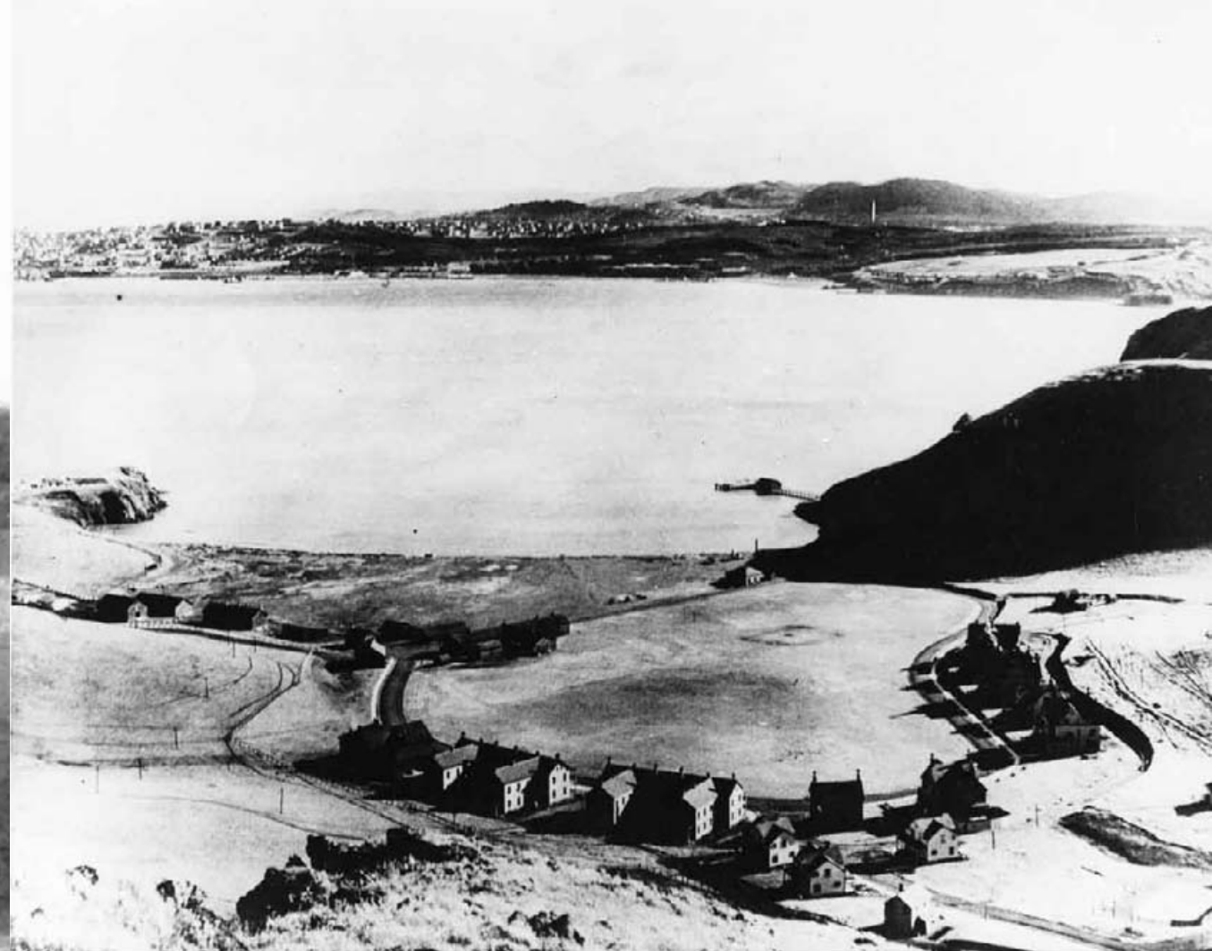
Above: Fort Baker, 1918. Military buildings are aligned around the main parade ground, with direct views of Horseshoe Cove. (circa 1918)