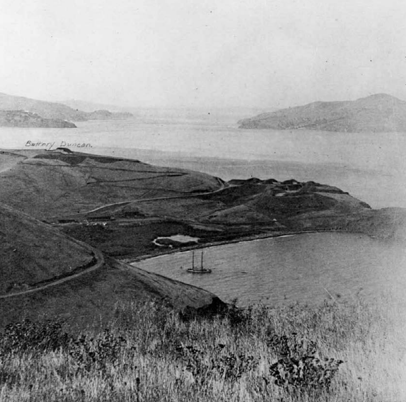
This early photo of Horseshoe Cove provides you with an idea of what this gentle harbor looked like around 1900. The military had already begun to shape the surrounding land with the construction of Batteries Cavallo, Yates and Duncan. But at the water's edge, before the buildings and the breakwaters were constructed, there was only a curved sand beach with brackish marshland to the north. (Photo circa 1900)