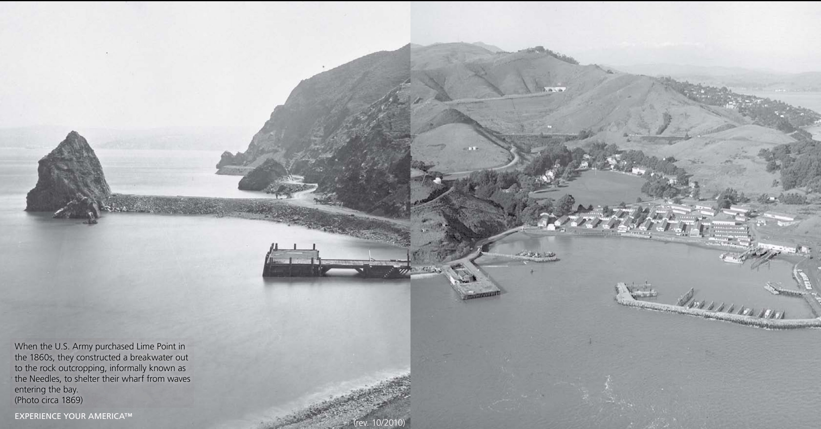
When the U.S. Army purchased Lime Point in the 1860s, they constructed a breakwater out to the rock outcropping, informally known as the Needles, to shelter their wharf from waves entering the bay. (Photo circa 1869)