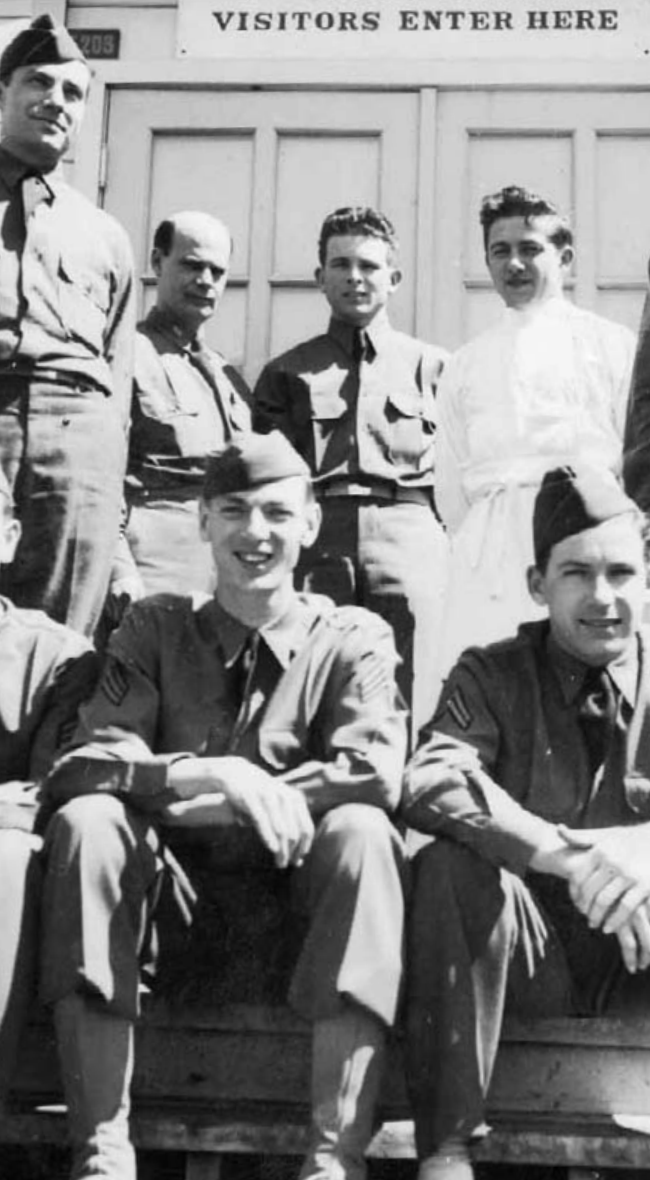
Above: Soldiers from the Medical Detachment, Fort Baker Station Hospital. (Photo circa 1942)

the late 1940s, the Fort Baker Station Hospital was converted to the Fort Baker Medical Laboratory. The laboratory divisions included immunology, entomology, pathology and chemistry. The armed forces of the western states sent in specimens and the army scientist conducted experiments with bacteria, chemicals, radiation and lethal gases. Much of their research here had world-wide significance and the army shared their findings with the World Health Organization. By the 1970s, the army discontinued the use of the hospital buildings and removed them in the 1980s.