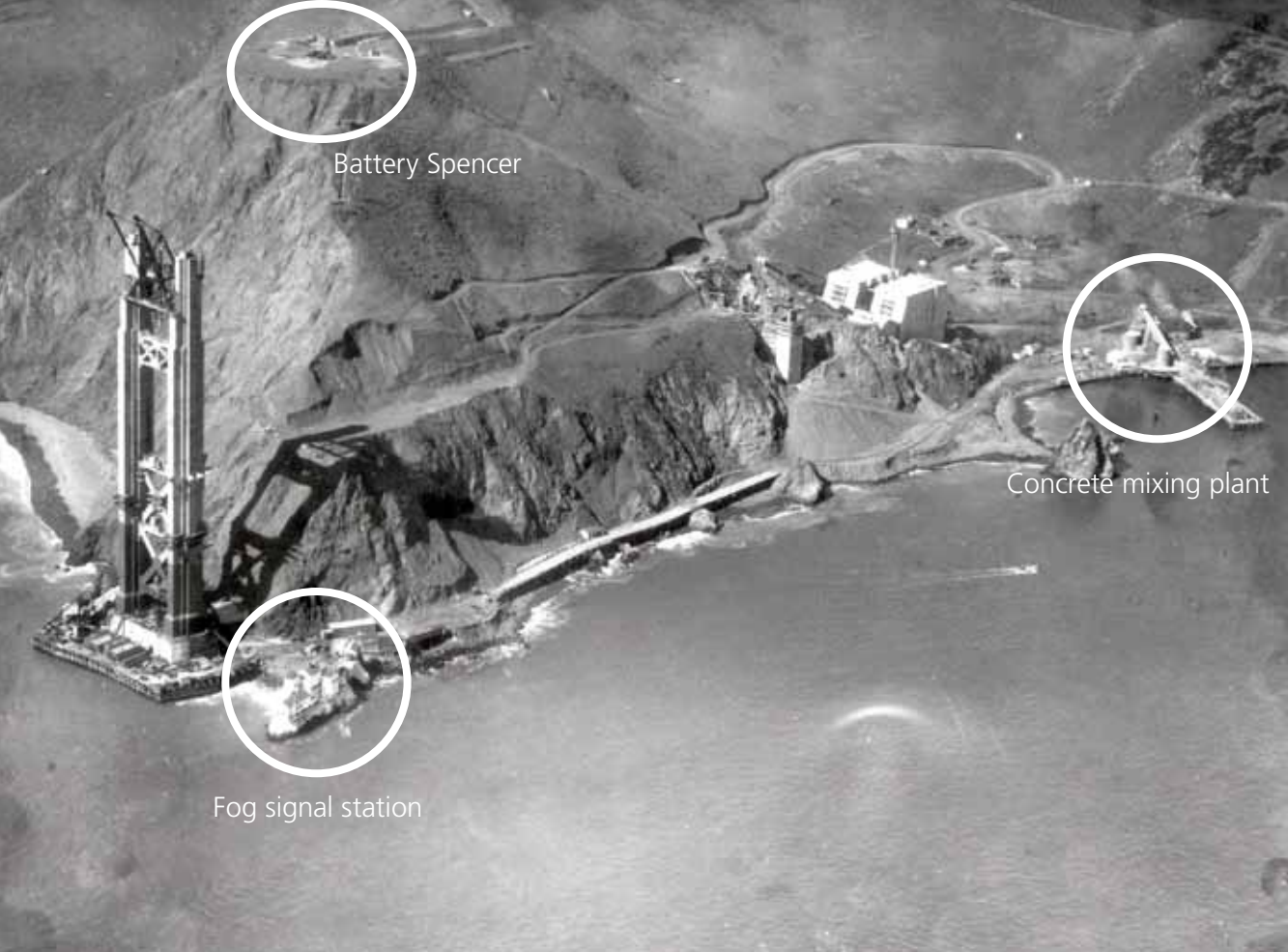
Above: The Golden Gate Bridge was constructed between 1933 and 1937. The pier for the north tower abutted the base of Lime Point and the Horseshoe Cove area was used as a staging area for construction activity. Note the fog signal station at the lower left and the bridge-related concrete mixing plant just north of the Needles. (circa 1934)