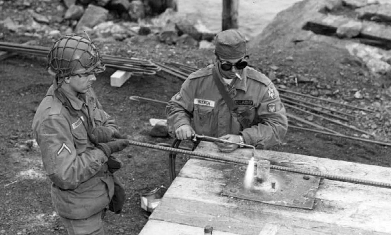
Soldiers of the 561st Port Construction Engineer Company bending rebar for a construction project. (Photo circa 1960)

During the 1950s and 1960s, Horseshoe Cove was the home of the 561st Port Construction Engineer Company. Dubbed the “Army’s Navy,” this outfit was trained to construct and repair ports quickly, anywhere in the world and often under combat conditions. The 561st also conducted rescues and aided in civil emergencies. The soldiers, outfitted with diving helmets and scuba gear, had many underwater responsibilities, including pier inspections, welding deteriorated ship hulls and clearing shipwrecks. They operated out of a huge barge, outfitted with a 40-ton crane, capable of ocean voyages.