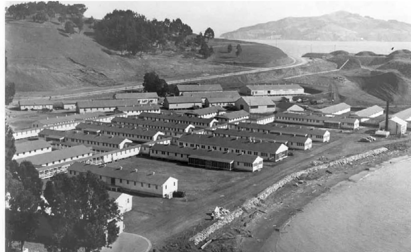
This photograph shows the Fort Baker Station Hospital at the height of activity.

Overtime, as World War II continued and Harbor Defenses responsibilities were reduced, the Station Hospital increasingly became a branch of the Presidio's Letterman General Hospital, which continued to provide care to wounded soldiers returning from the war in the Pacific. In