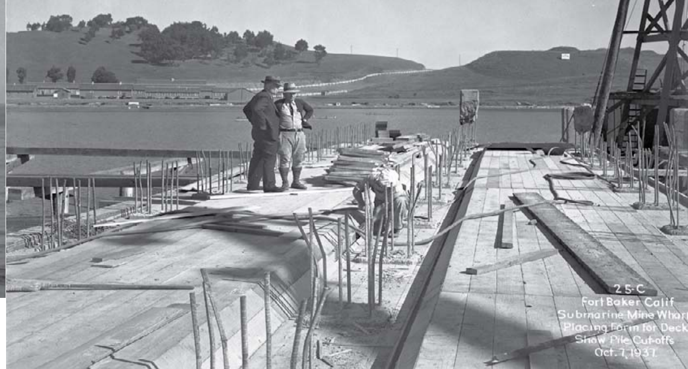
As early as 1937, as part of the pre-war mobilization effort, the army constructed a submarine mine wharf to allow large mine planter ships to dock at Horseshoe Cove. The new wharf, built with concrete and pilings, was a large-scale construction project abutting the 1903 quartermaster supply wharf. Note Fort Baker's open landscape in the background. (Photo circa 1937)

channel with underwater minefields and shore batteries. These minefields consisted of hundreds of buoyant TNT-filled mines, operated from shore by an elaborate system of underwater sensors, electric cables and submerged junction boxes. These electric mines were anchored to the ocean floor in minefields outside the Golden Gate through a complex series of cables, weights and floats. To install the mines, Coast Artillery soldiers operated "mine planters;" large ships docked at Horseshoe Cove with powerful cranes and hoists for raising and lowering the mines into the water. If an enemy ship or submarine was identified, the Coast Artillery soldiers would detonate the mines by remote control.