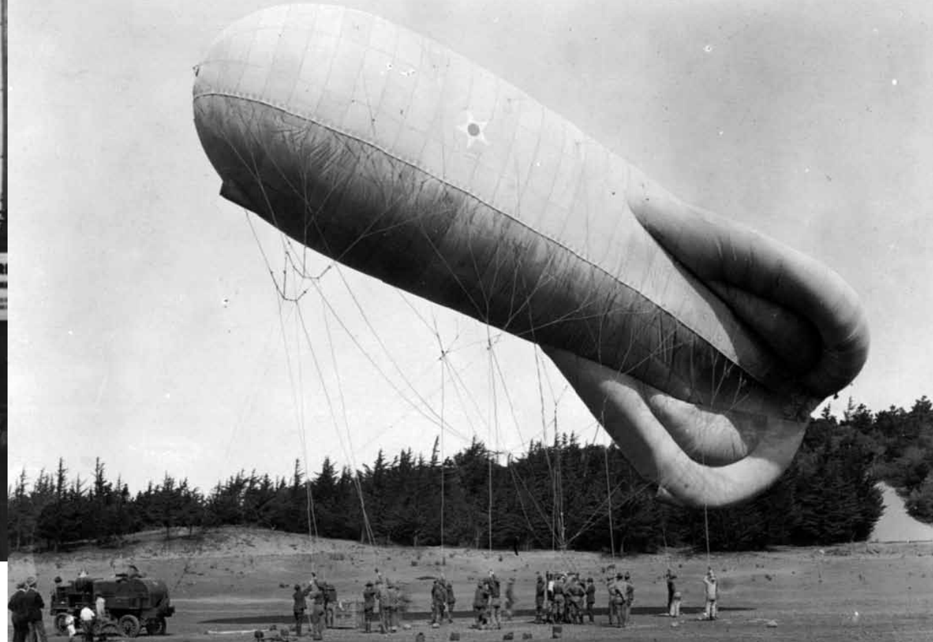
Above: Soldiers preparing their balloon for departure at the Presidio in the 1920s. Measuring 92 ft. long and 32 ft. in diameter, the balloon could stay aloft in winds as high as 70 mph. Dubbed the "sausage balloons," these airships consisted of a hydrogen-filled body with fins that provided stability in rough air and a suspended wicker basket that held a two-man crew.

From Battery Mendell, return to Field Road and continue back towards the Marin Headlands Visitor Center, traveling 1.8 miles to the next stop. As you travel on Field Road, you will pass through a cluster of three, small, wood-frame buildings. These buildings are remnants of Fort Barry's service area, which originally included a storehouse, a bakery and stables. After the Visitor Center, turn right onto Bunker Road and continue east to the stables at the Presidio Riding Club. While this area is closed to the public, you can easily see the large, unusually-shaped building behind the stables.