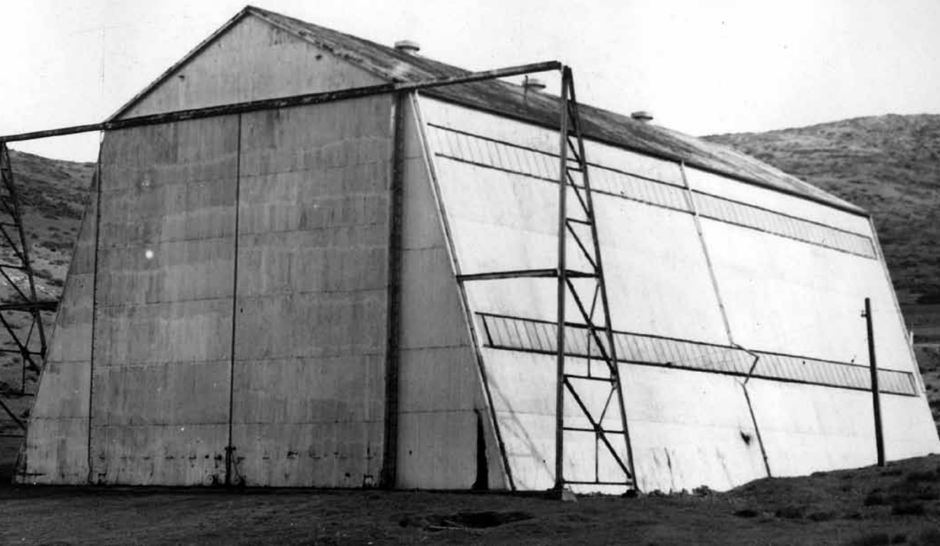
Above: The Fort Barry balloon hangar. The front of the balloon hangar originally had towering sliding doors that hung on the adjacent steel frames when open. The building's interior was 120' of clear space, which could easily accommodate an inflated observation balloon. During World War II the hangar was remodeled for use as a motor pool building; the sliding doors were removed, and shops and offices were constructed inside. (Photo circa 1940)

would need permanent structures for the balloons to avoid damage. Three new balloon hangars, constructed at Fort Barry, Fort Winfield Scott at the Presidio, and Fort Funston in San Francisco, were enormous, galvanized-iron shed buildings with a unique gambrel shape that allowed for the balloon to be stored either inflated or deflated. A generator house, connected to the hangar by a buried 6" pipe, provided the highly flammable hydrogen gas used for inflating the balloons. To the north of the hangar was a designated "balloon field," an