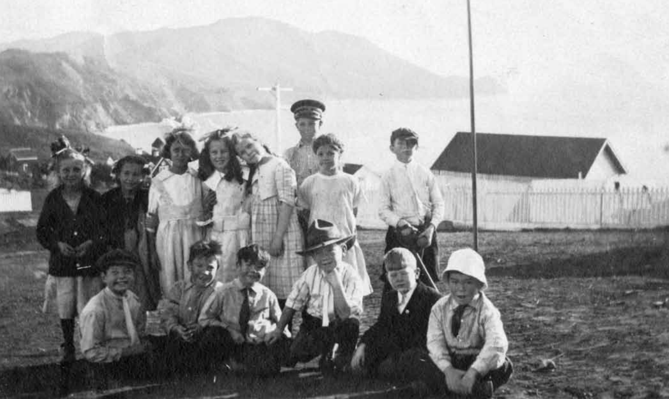
Above: Children of the Point Bonita Reservation. Officers of the U.S. Army Corps of Engineers brought their wives and children to live with them at the construction site. By 1915, there were so many children that the army agreed to provide a school building for the families. Life at Point Bonita Reservation must have been a delight of fresh sea air and wild, open spaces. Notice the sweeping landscape of Bonita Cove in the background. (Photo circa 1915)

From the Point Bonita Lighthouse parking lot, continue up the hill on Field Road .2 miles to the parking lot in front of Battery Mendell. To the north, you can see Fort Cronkhite (the World War II cantonment) and behind you, the two big gun emplacements of Battery Wallace (constructed between 1917-1921). The other Fort Barry batteries (Alexander, Smith-Guthrie, O'Rorke and Rathbone-McIndoe) are dug into the first hill to your left. If time permits, continue out to the ocean overlook near Bird Island and take in the tremendous views. On a clear day, you can see north along the jagged cliffs all the way to Point Reyes and south to Ocean Beach and Pacifica.