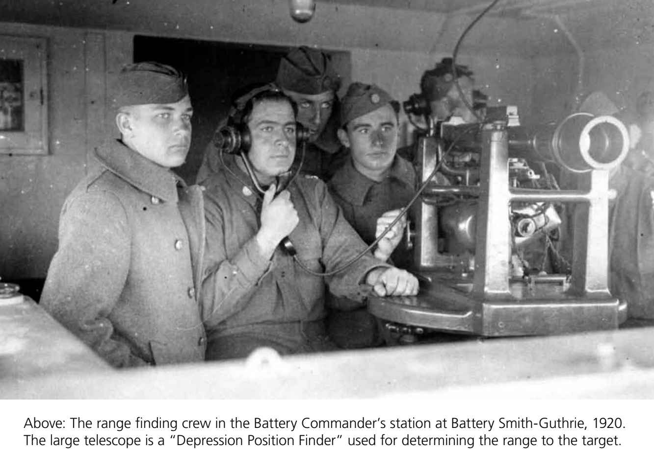
Above: The range finding crew in the Battery Commander's station at Battery Smith-Guthrie, 1920. The large telescope is a "Depression Position Finder" used for determining the range to the target. The soldiers with the headphones are talking to the off-site plotting room and gun crews. (Photo circa 1920; courtesy of the California Military Museum)

During this early period, the engineers constructed four other batteries: Battery Alexander (1902), Battery Smith-Guthrie (1904), Battery Samuel Rathbone (1905) and Battery Patrick O'Rorke (1905). Later, the army constructed Battery Wallace (1917-1921), Antiaircraft Battery No. 2 (1920-1925), and Battery Construction No. 129 (1942-1944). A complex underground system of communication cables connected all the batteries so that the men stationed throughout the fort could communicate with one another.