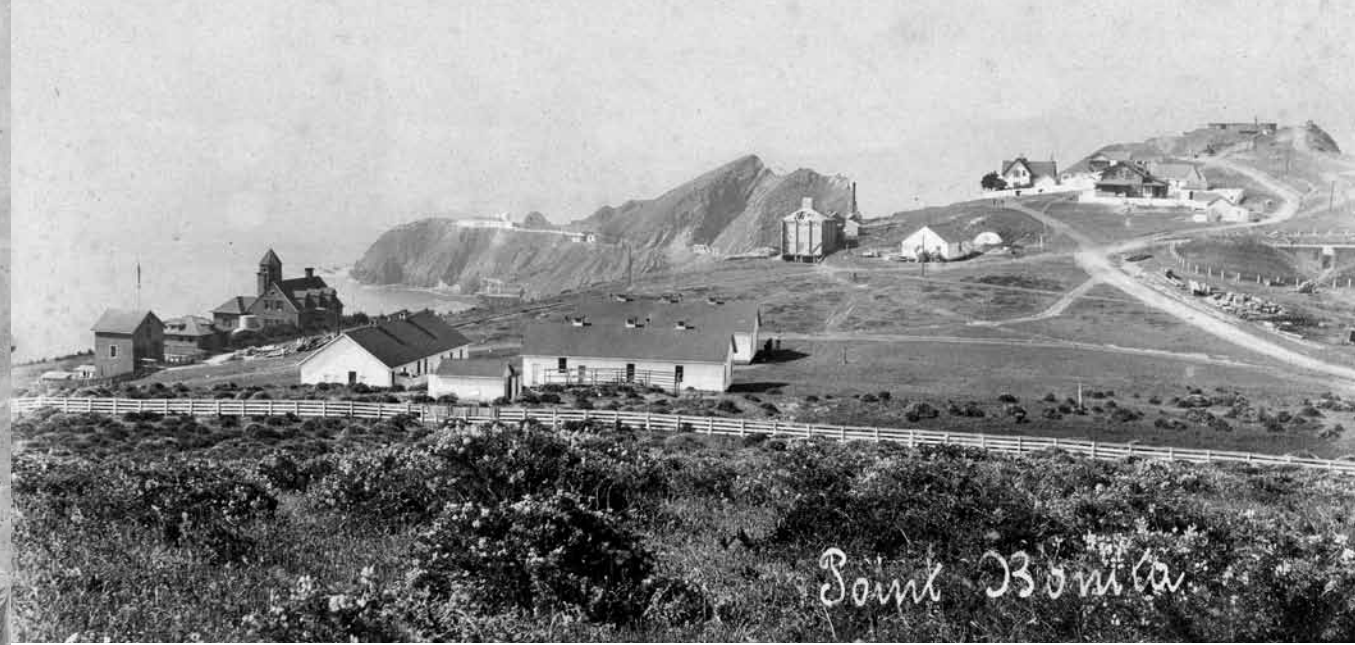
Above: Point Bonita Reservation around 1915. During this time, there were many activities at the Reservation. There was the Lifesaving Service station (far left); the U. S Army Corps of Engineers' bunk houses and mess hall (left); the concrete plant (middle); the army stables (right middle) and the lighthouse keepers' residences (right). The Point Bonita Lighthouse (in the distant left center), constructed in 1855, was the third lighthouse on the West Coast.