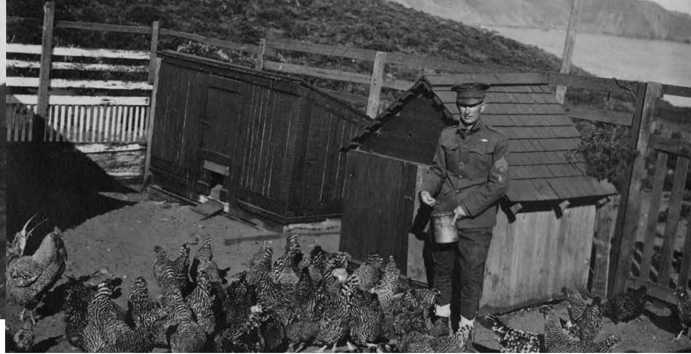
Above: A Fort Barry soldier feeding chickens. The Engineering Camp at Point Bonita Reservation was very isolated; in order to obtain fresh food supplies, the soldiers had to brave the winding, treacherous drive to Sausalito. Soldiers managed a flock of chickens to ensure a steady supply of fresh eggs for the military families. (Photo circa 1910)