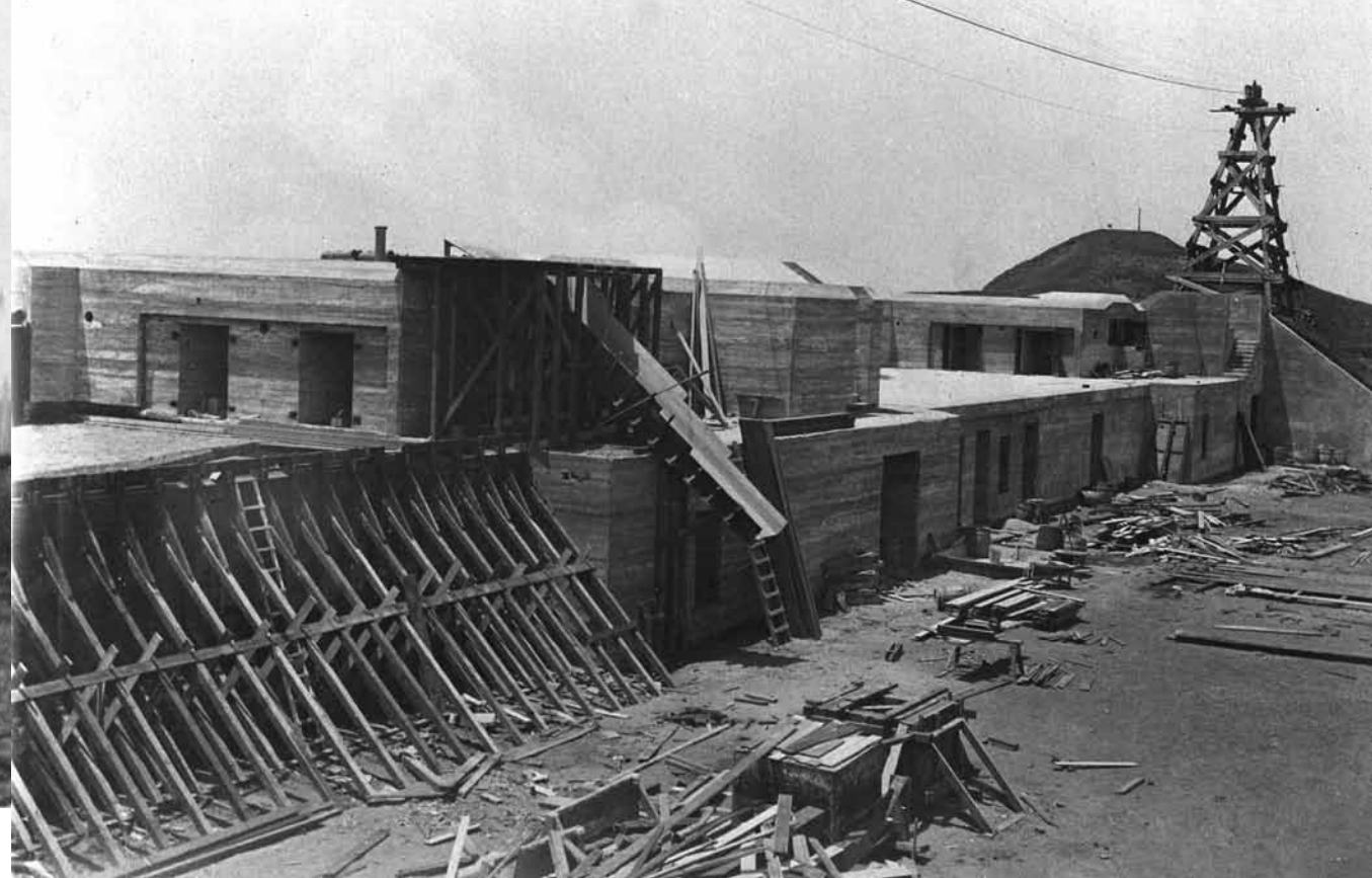
Above: Construction of Battery Mendell. To construct these huge batteries, workers erected structural forms created by braced vertical wood planks (at left). They then poured wet concrete into forms and left it to harden or "cure" for several days. Once the concrete had dried and set, the wooden forms were then peeled off from the finished concrete wall. Note the amount of lumber necessary for this project. (Photo circa 1902)

From the Point Bonita Lighthouse parking lot, continue up the hill on Field Road .2 miles to the parking lot in front of Battery Mendell. To the north, you can see Fort Cronkhite (the World War II cantonment) and behind you, the two big gun emplacements of Battery Wallace (constructed between 1917-1921). The other Fort Barry batteries (Alexander, Smith-Guthrie, O'Rorke and Rathbone-McIndoe) are dug into the first hill to your left. If time permits, continue out to the ocean overlook near Bird Island and take in the tremendous views. On a clear day, you can see north along the jagged cliffs all the way to Point Reyes and south to Ocean Beach and Pacifica.