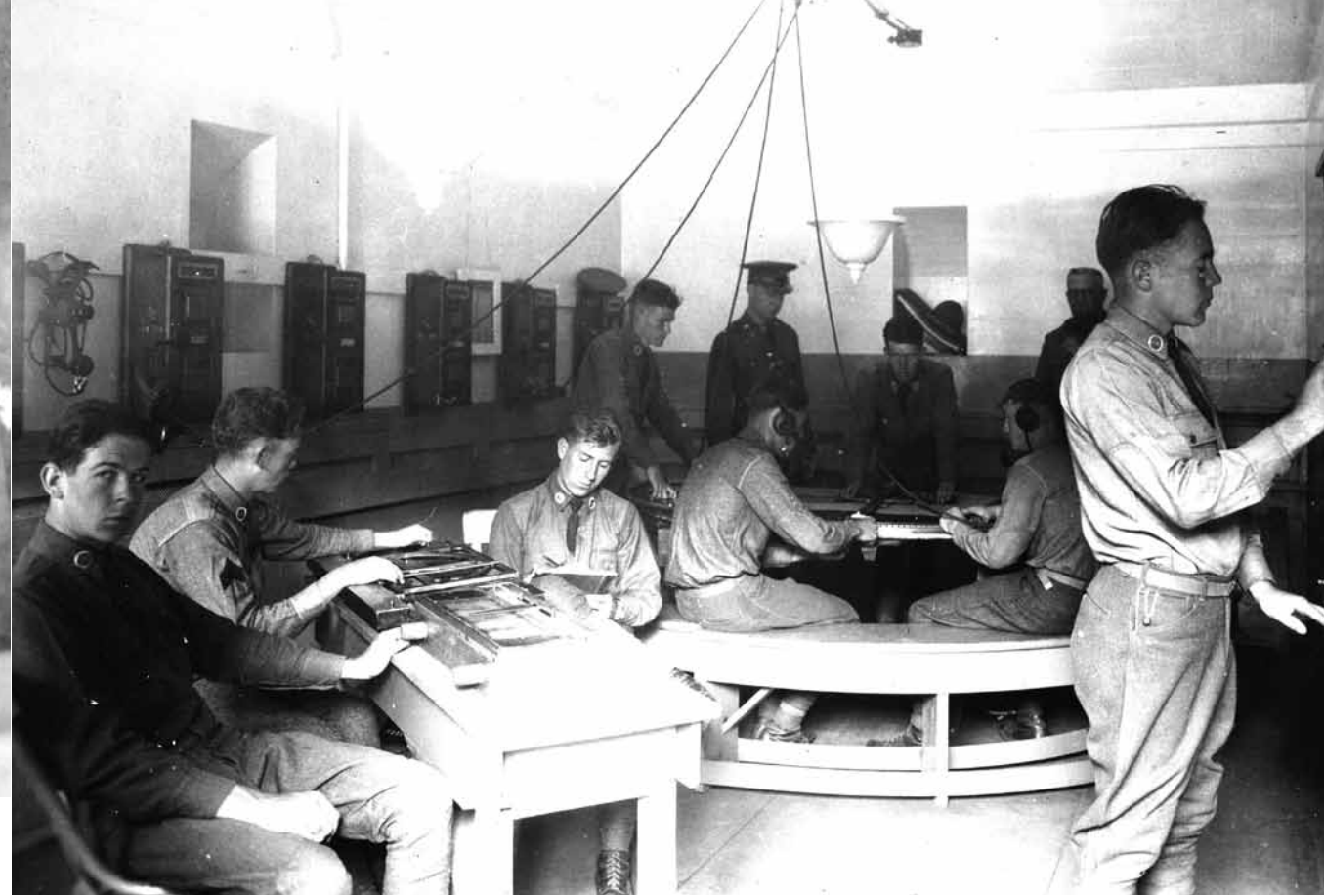
Above: A plotting room where the soldiers received observation readings from "fire control stations" scattered along the coast and determined the ranges to targets. The men in the center are calculating the general range at the plotting table, while the soldiers at left are using a device that corrected for environmental variables like wind and humidity. (Photo circa 1930s)

The construction of the Fort Barry tunnel in 1918 was critical to the post's activities. The viability of Fort Barry and the new powerful coastal batteries depended heavily on reliable access to Fort Baker and to Sausalito, the post's sources for military supplies, the railroad and groceries. Before 1918, when the surf was too rough for boats to land at