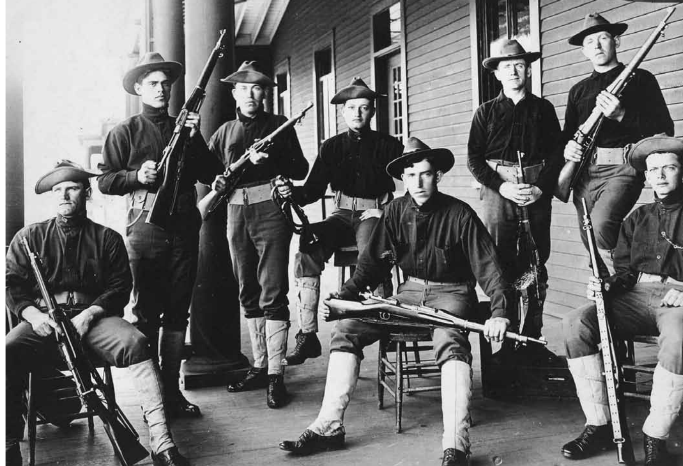
Above: Fort Barry soldiers proudly showing off their state-of-the-art, Model 1903 Springfield rifles. Notice that the soldier fourth from the left is holding a bugle. The army used bugle calls for marking the events of the day and company buglers frequently entered into friendly competitions. (Photo circa 1908)

Fort Barry's wood-frame, three-story barrack buildings represented an improvement in military housing. Prior to the Endicott-period upgrades, living conditions in the U.S. Army were dismal; most buildings were poorly constructed, cramped and unsanitary. However, by the early 1900s, in order to stem the flow of deserters and encourage recruitment, the army began to design larger barracks with a new emphasis on proper ventilation, clean running water and modern toilet facilities. The Fort Barry