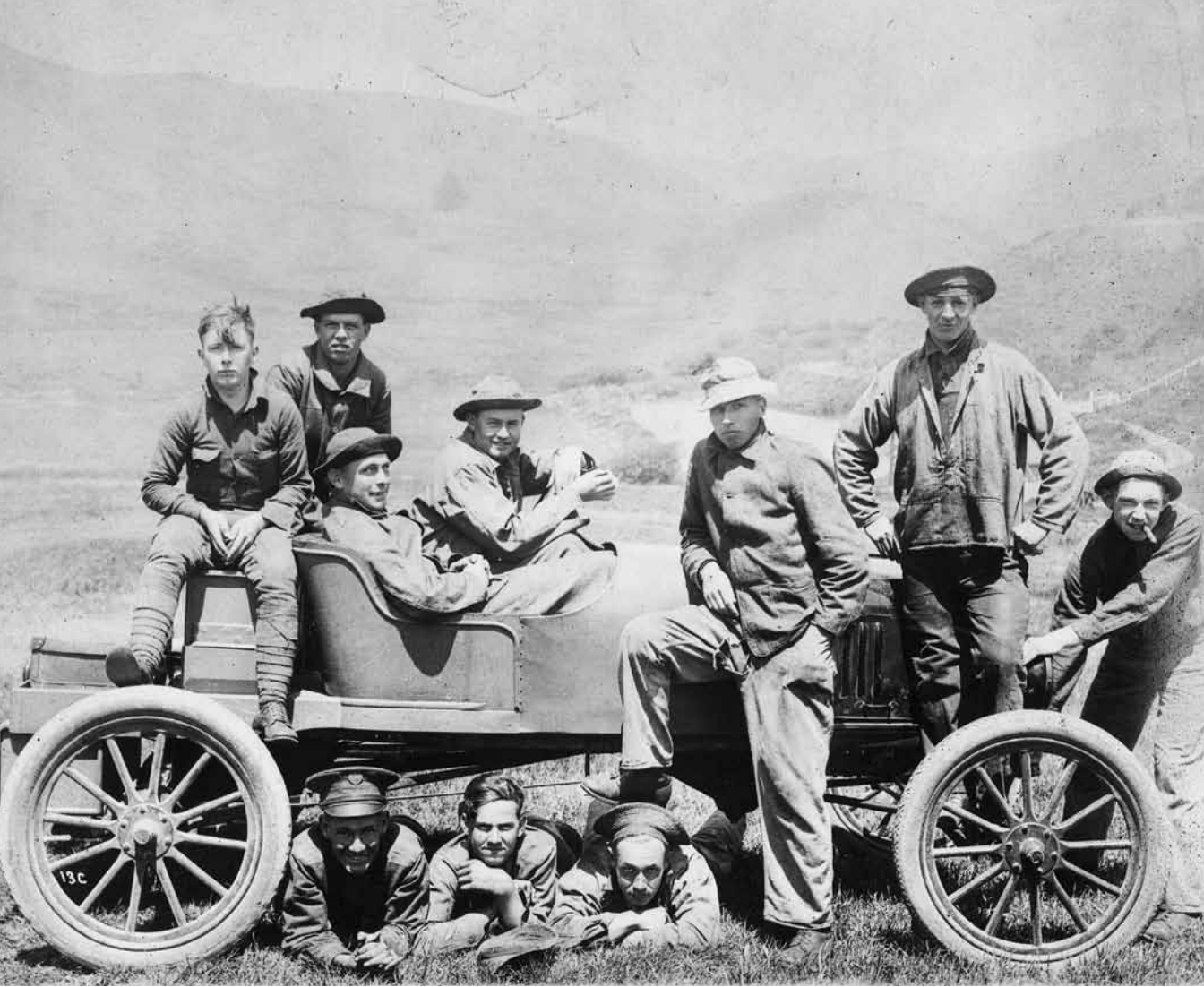
Above: Fort Barry soldiers at ease on the Fort Barry parade ground. Notice the rolling undeveloped hills of the Marin Headlands behind the men and their car. (Photo circa 1918)