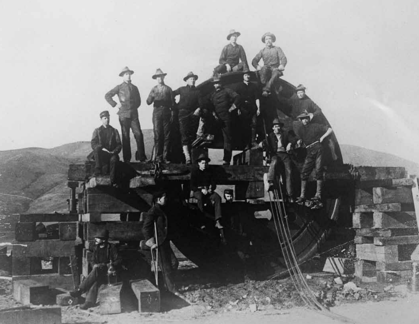
Above: Fort Barry soldiers during the construction of Battery Mendell. The men are posing with a large metal base ring, used with a 12" mortar, prior to its installation. Notice the cables and large lumber required to keep the piece in place. (Photo circa 1903)

Endicott-period batteries did not provide any covering or overhead protection for the guns because aerial attack wasn't yet considered a threat.