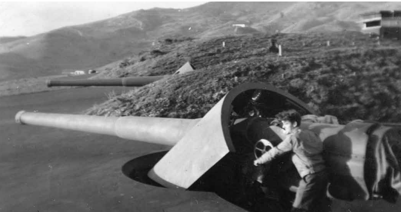
Below: A soldier posing at the guns of Battery Smith-Guthrie. (Photo circa 1941)

This marks the end of the tour. Please feel free to explore the Marin Headland's other historic forts—Fort Baker and Fort Cronkhite. The park hosts monthly workdays and volunteer programs where you can become a docent, help restore historic buildings, remove non-native vegetation, and collect data on our wildlife. For more information, talk to the staff at the Marin Headlands Visitor Center, or visit the park's website at: www.nps.gov/goga/