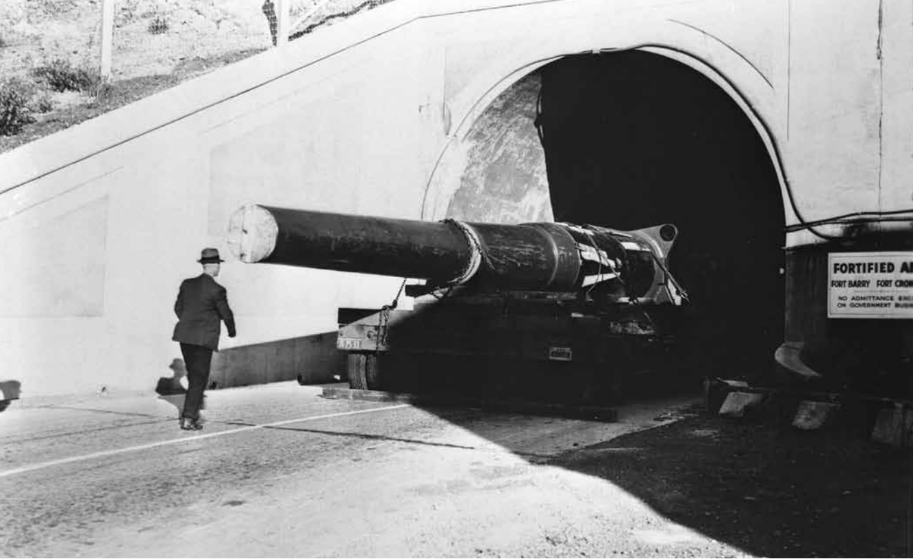
Above: One of the battery's 12-inch gun tubes emerging from the Fort Barry tunnel. (Photo circa 1939)

From Battery Mendell, return to Field Road and continue back towards the Marin Headlands Visitor Center, traveling 1.8 miles to the next stop. As you travel on Field Road, you will pass through a cluster of three, small, wood-frame buildings. These buildings are remnants of Fort Barry's service area, which originally included a storehouse, a bakery and stables. After the Visitor Center, turn right onto Bunker Road and continue east to the stables at the Presidio Riding Club. While this area is closed to the public, you can easily see the large, unusually-shaped building behind the stables.