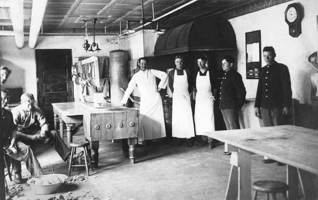
Above: The Fort Barry cooks and kitchen-patrol (KP-duty) soldiers served three meals a day to over 100 men. Notice that while this traditional army kitchen is complete with the heavy butcher-block table, hanging utensils and a soldier peeling pounds of potatoes, the room itself is not rough or primitive. During this time, the army's standard kitchen plans still called for ornate, metal-pressed ceilings, gas lighting and an elegant wall clock. (Photo circa 1908)

third floor. Each barracks building even had its own tailor and barber shop. All the Fort Barry buildings were built with electricity, hot and cold running water, and proper toilets and shower facilities.