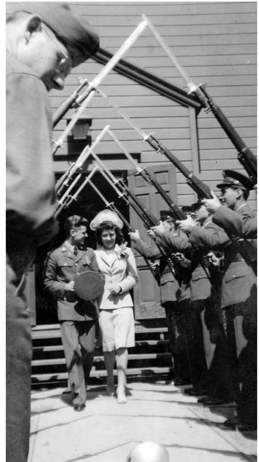
Right: A Fort Barry wedding during World War II. The groom, an enlisted soldier with the 6th Coast Artillery, and his new bride are entering the military's traditional "arch of steel" that symbolizes a couple's safe passage into marriage. The army constructed the Fort Barry Chapel in 1941 to provide multi-denominational services for both the Fort Barry and Fort Cronkhite soldiers. The historic chapel is now the National Park Service's Marin Headlands Visitor Center. (Photo circa 1940s)