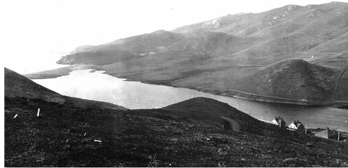
Rodeo Lagoon in 1913. Even after the army established Fort Barry, the Marin Headlands was still a very rural and open landscape. To the right are two Fort Barry army residences and the post guard house (no longer extant); across the lagoon, a dairy farm is nestled in the valley where Fort Cronkhite is now located. (Photo circa 1913)

From the Marin Headlands Visitor Center, carefully walk from the parking lot, crossing Field Road onto Bodsworth Street, and proceed up the hill. Turn left onto Simmonds Road and continue straight towards the buildings, following the signs to the Headlands Center for the Arts and the Marin Headlands Hostel. You can also pick up the Coastal Trail here that leads you to the historic rifle range (see Stop # 6) and the Golden Gate Bridge.