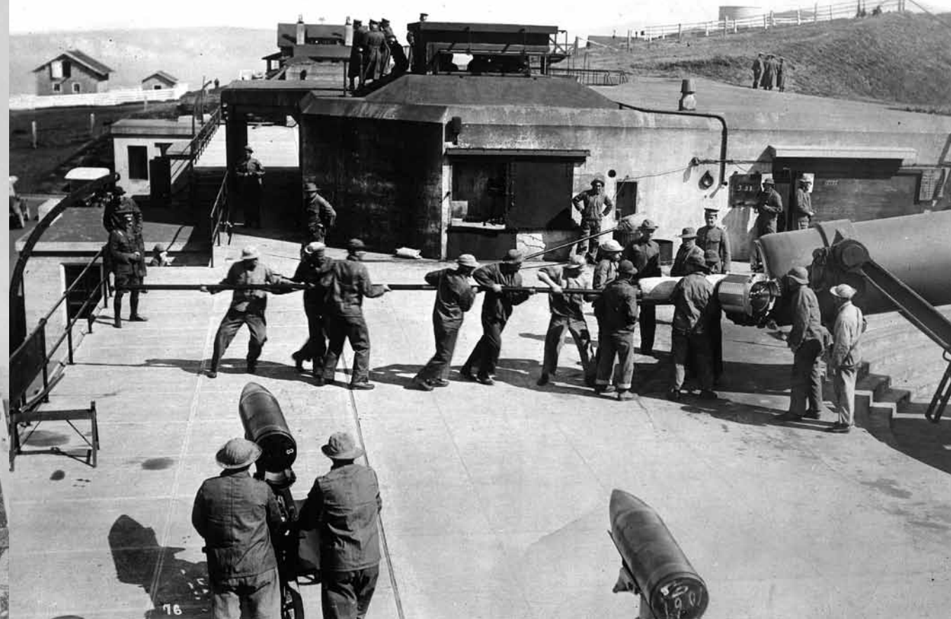
Above: Target practice at Battery Mendell. The soldiers in the center are loading a powder bag into the breach of the gun in the "down" position. Note that it required six men to push the ramrod to load the gun. In the foreground at left, two men are waiting with a "shot cart" that held the next shell to be loaded. Notice the Point Bonita Lighthouse keepers' residences behind the white fence at the back left. (Photo circa 1920)

Battery Mendell was outfitted with the army's modern innovation: a pair of 12-inch guns on "disappearing carriages." When the guns were ready to fire, they would rise into position, fire a single shot and then recoil down and out of sight for reloading; ing guns and the soldiers were hidden from enemy view behind a huge concrete parapet camouflaged into the surroundings.