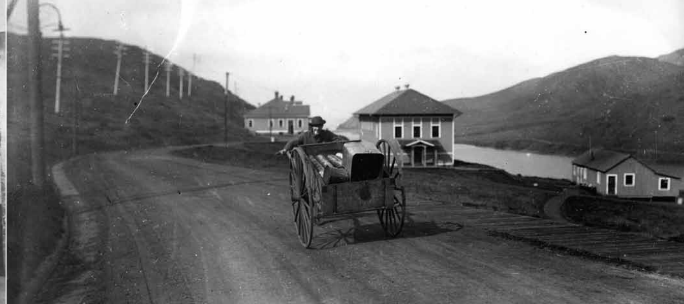
Above: A soldier pushes a wheelbarrow of metal cans and firewood up Simmonds Road. Behind him are the guardhouse (left), the post gymnasium (still standing today) and the post exchange (right), where the soldiers bought dry goods, supplies and cigarettes. Some of the historic buildings, including the guardhouse and the post exchange have been removed, which explains the occasional gaps between buildings today. (Photo circa 1908)

The Marin Headlands Hostel , located in Building 941, offers affordable overnight accommodations in the post's historic hospital. The Hostel welcomes visitors during business hours.