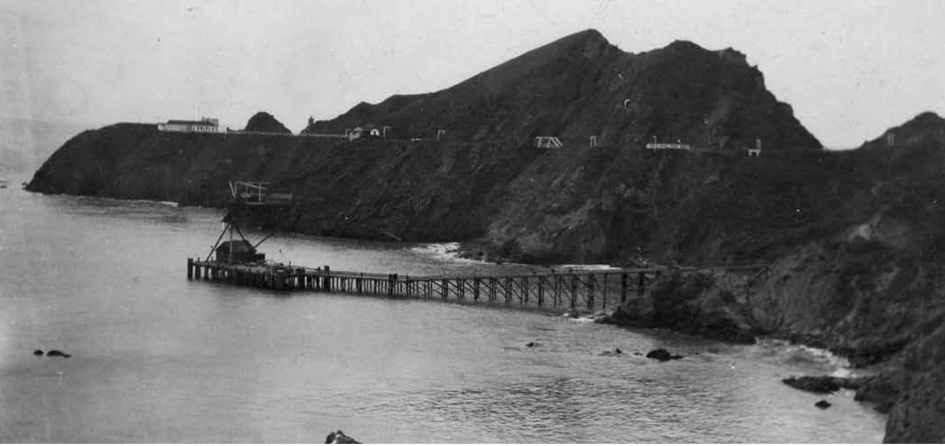
Above: A view of the engineers' wharf and trestle down at Bonita Cove, as well as the tunnels and walkways leading to the Point Bonita Lighthouse in the background. (Photo circa 1915)