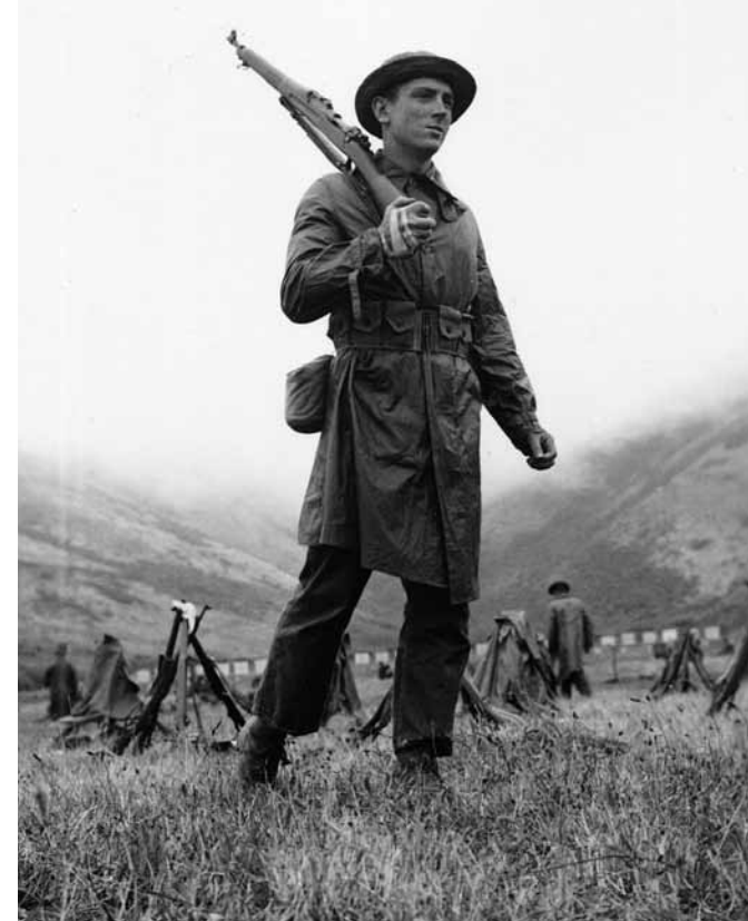
Above: A soldier standing at a firing point, taking a break from firing during the inclement weather. His ammunition belt holds a clip of bullet rounds for his M1903 Springfield rifle. In the background, additional rifles are arranged in teepee-like stacks of four with their barrels pointing upwards. (Photo circa 1941)

This now quiet, man-made outdoor space used to ring loudly with sounds of rifle shots. During the late 1800s, the rifle target scores for all of the army companies within the Pacific Division were so poor that the army was forced to take action. In early 1904, Gen. Arthur MacArthur (then Commander of the Pacific Division) appointed a Board of Officers to explore the idea of creating a single Department-wide target range, open to all infantrymen in the Pacific Division. The Board of Officers identified this area in Fort Barry as the most suitable location, but the Secretary of War declined to forward MacArthur's proposed $125,000 construction project to Congress. Not to be deterred by the lack of funds, Gen. MacArthur found a solution by using his most