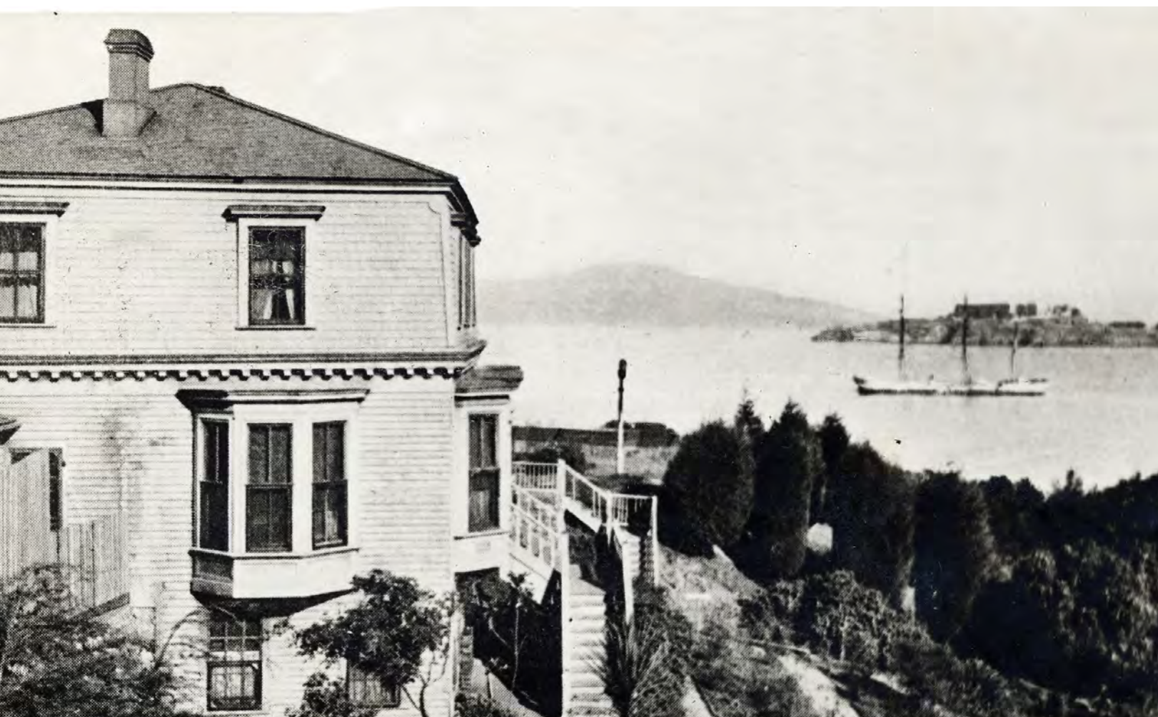
The Palmer House, built by a private citizen, was a two-and-a-half wood frame Italianate structure with hipped roof and bay windows. Note Alcatraz's Civil War citadel in the background. (Photo courtesy of the San Francisco Public Library; photo circa 1885)

Please remain where you are, with a view of the Haskell House (Building 3) to your left. The Leonard Haskell residence was the place of U.S. Senator Broderick's untimely death.