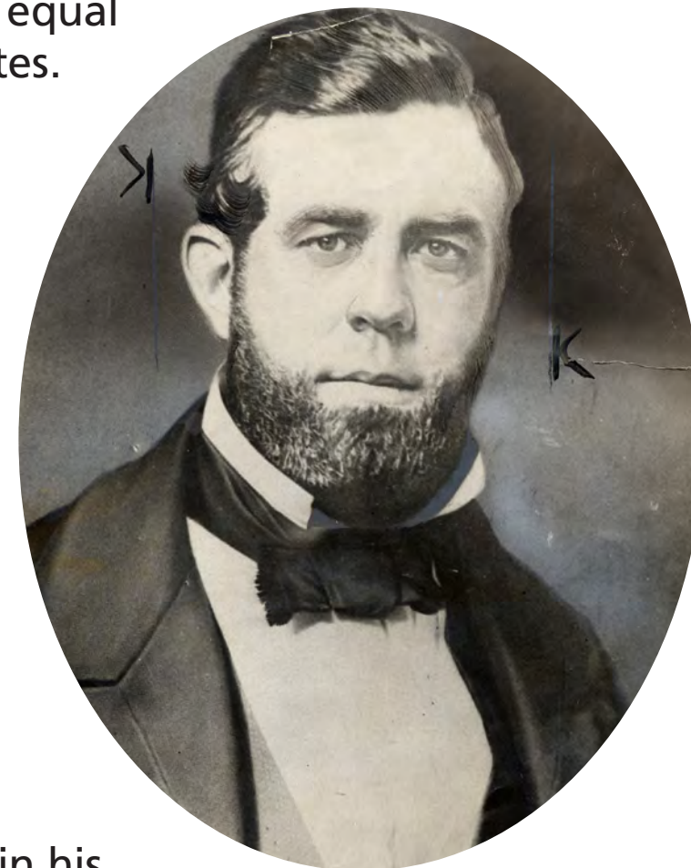
California U.S. Senator David Broderick

The Broderick-Terry Duel, an important chapter of the anti-slavery movement, is associated with the Black Point community. During the 1850s, the people living here were openly hostile to secession and slavery. They politically supported David Broderick, a self-made man opposed to slavery, in his effort to become California's U.S. Senator. In 1859, after Broderick responded to verbal abuse from his political opponent, California State Supreme Court Justice David S. Terry, Terry challenged him to a duel. On September 13, 1859, the Broderick - Terry duel commenced at Lake Merced, south of the city. After Broderick's gun misfired, Terry shot Broderick and wounded him severely. After his friends rushed him to Haskell's Black Point