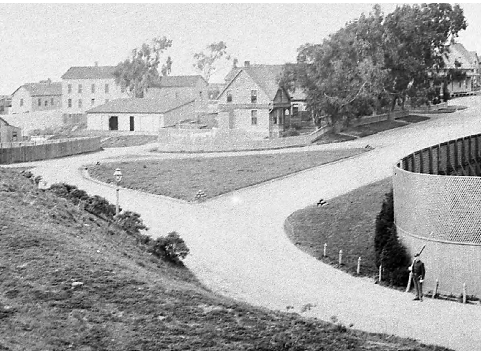
By the late 19th century, the army's improvements to Fort Mason made the post look more formal. This photo shows the elegant streetscape along Franklin and the well-maintained lawns, hedges and fences. (photo circa 1893)

Like all Army posts that sprang up throughout the west, the military designed Point San Jose to function as a small, self-sufficient town. The post included a post headquarters, a hospital, barracks, and mess halls clustered around the main parade ground. The army usually constructed the more utilitarian and displeasing buildings, like the latrines and the stables, at the outskirts of the post. The fortunate Point San Jose officers enjoyed living in the elegant bay-front homes that the army had appropriated. In 1882, the army changed