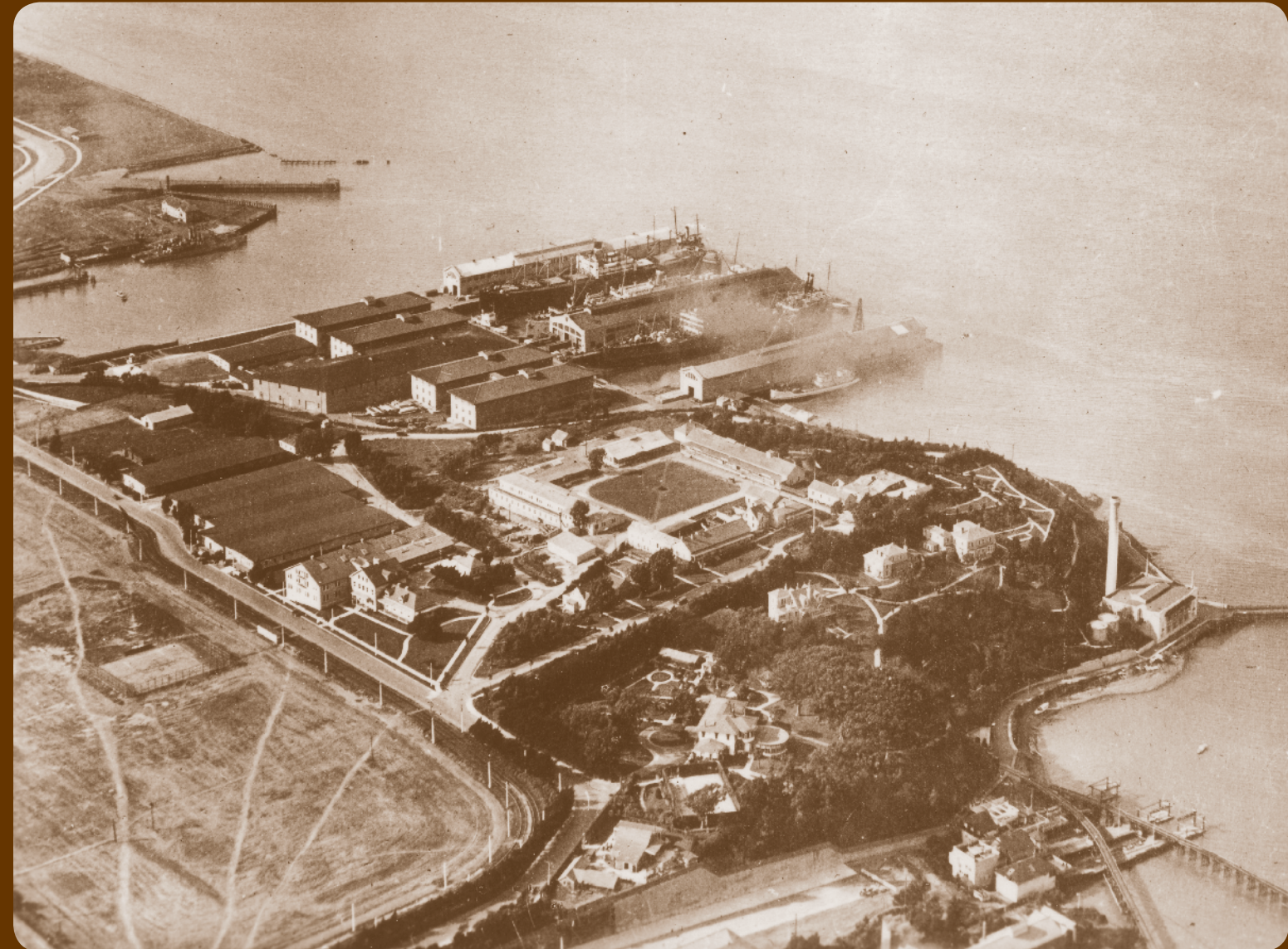
A 19th Century Army Post on a San Francisco bluff