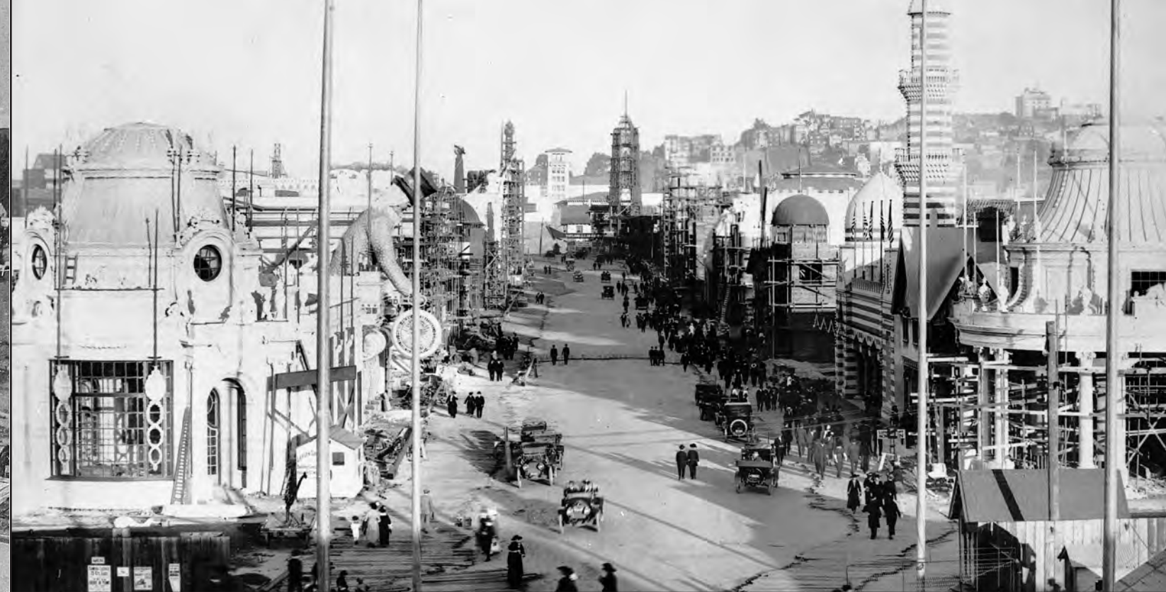
The Zone introduced visitors to the new concepts of national parks, by providing replicas of the Grand Canyon and Yellowstone National Park. (photo circa 1915)