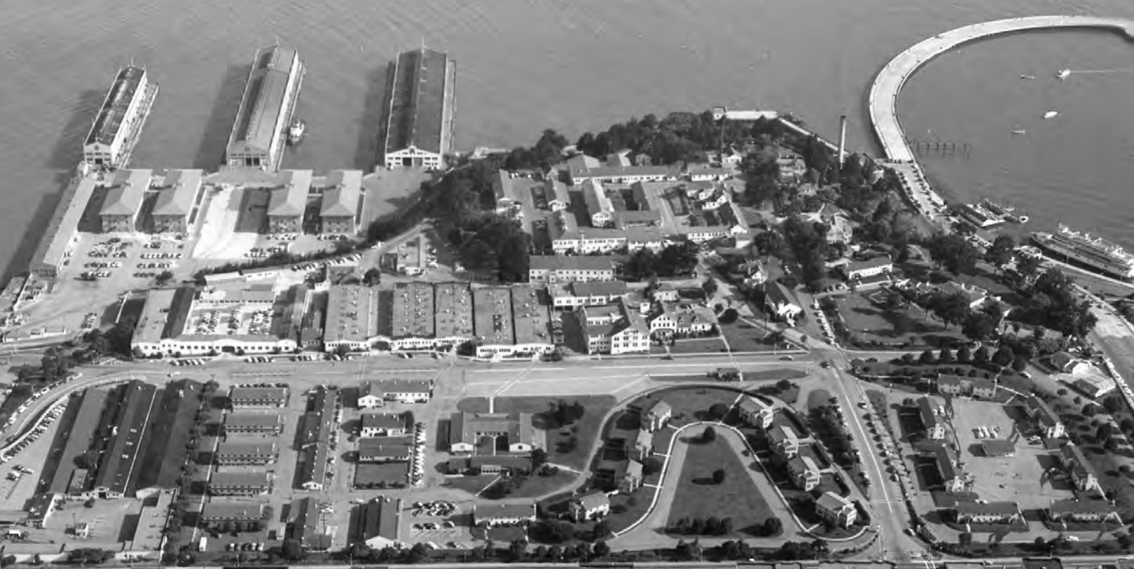
Fort Mason at its most developed, with World War II buildings constructed right up against Civil War-era buildings. Notice the San Francisco Port of Embarkation, with its piers and storehouses, in the upper right-hand side. (photo circa 1951)

If you are standing at the top of the Great Meadow, turn right and walk towards the overlook of large red-roofed buildings near the water. The Fort Mason Center, while not part of this tour, was originally the historic San Francisco Port of Embarkation.