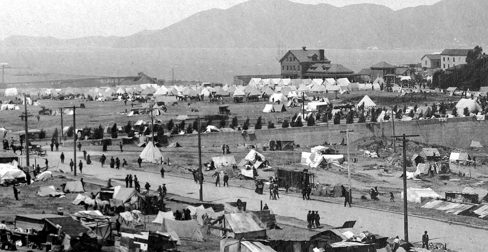
Fort Mason's sprawling earthquake relief encampment, one of several established throughout the city. Note the Park Headquarters building in the background. (Photo courtesy of the San Francisco Public Library; photo circa 1909)