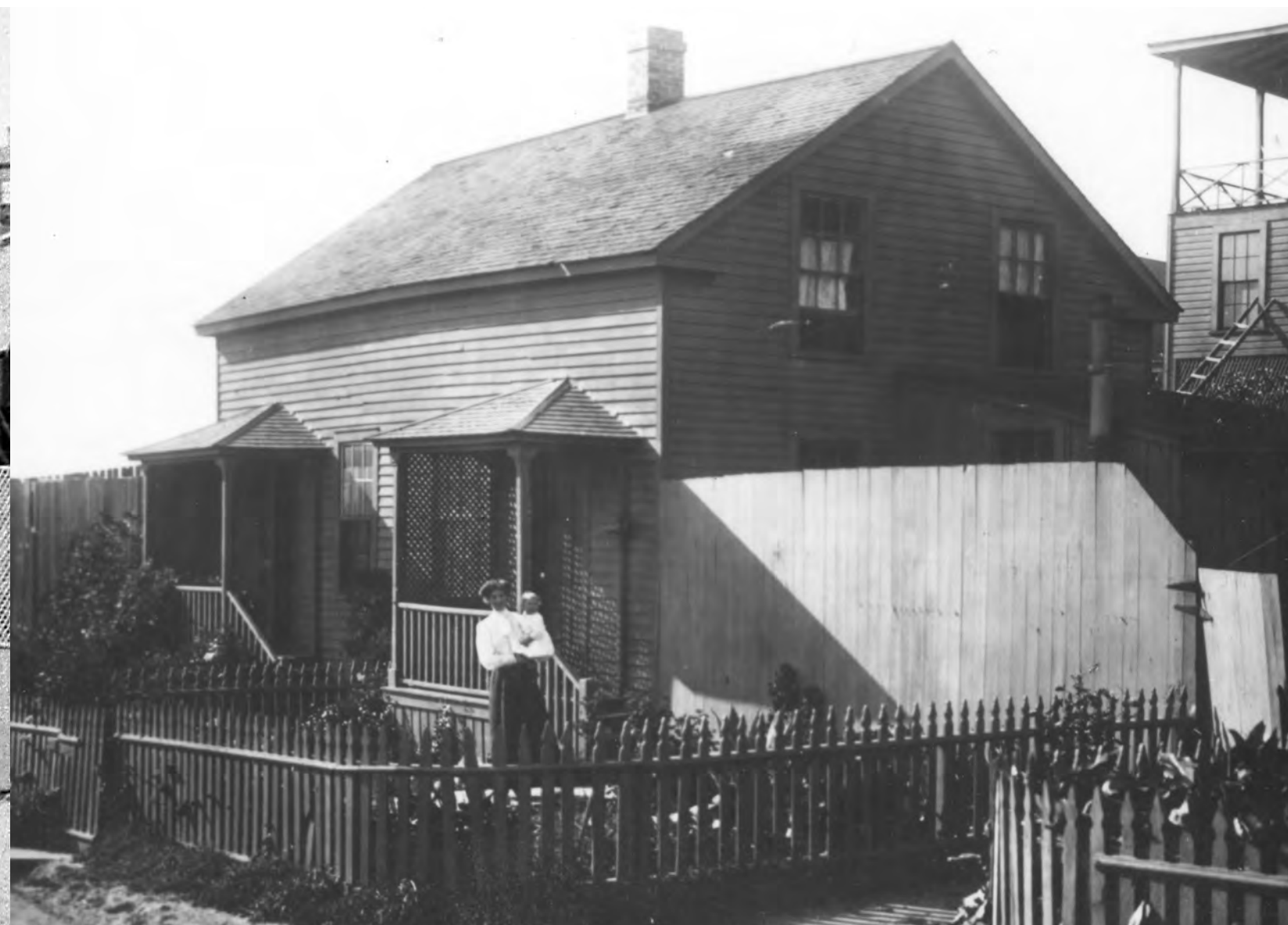
The Fort Mason officers were permitted to bring their families to live on post with them, by the turn of the 19th century. (photo circa 1900)

Walk down Pope Street, heading south towards the flag pole. At the flagpole, turn to your right and walk in front of the headquarters building. Follow the sidewalk to the Great Meadow, which is the large grassy field to the west side of William J. Whalen Building.