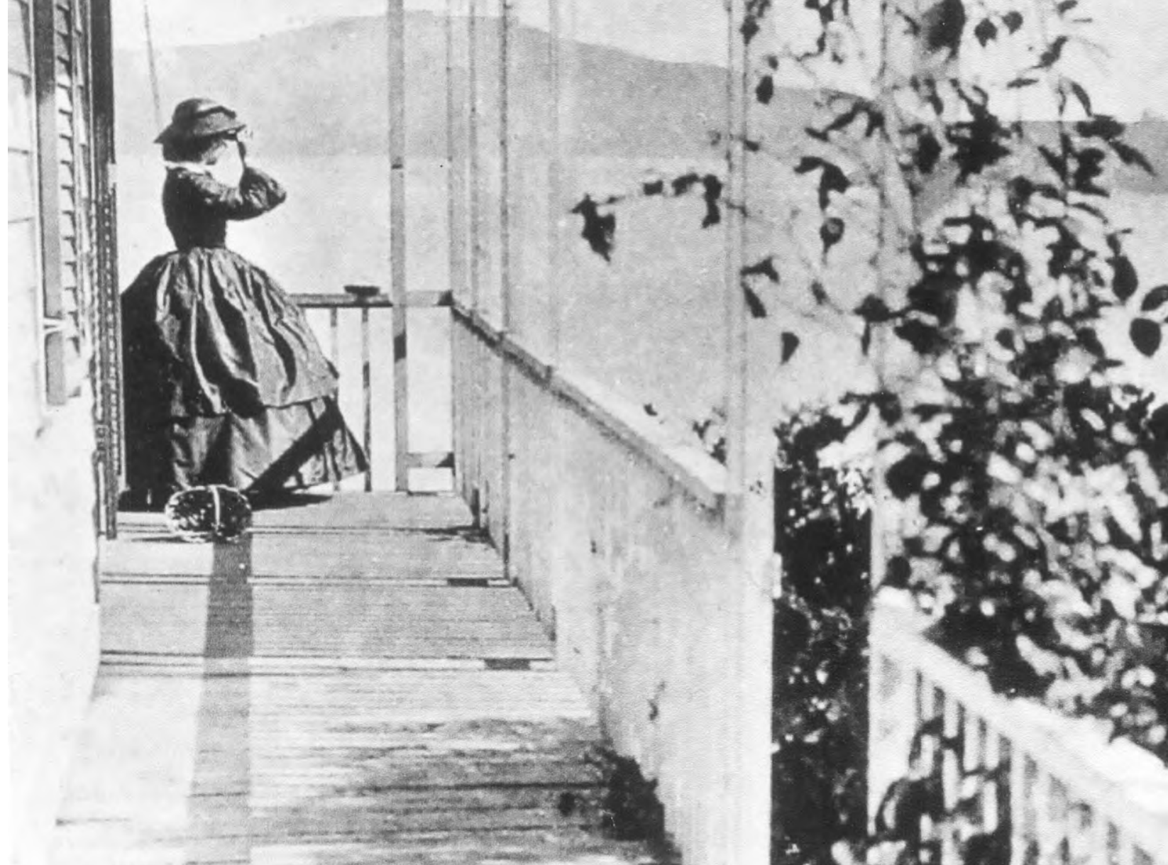
Jessie Benton Fremont on the porch of “Porter’s Lodge”, overlooking Alcatraz and Angel Island. (photo circa 1860s)

From Franklin, turn left (west) onto Funston Street. Walk down Funston and notice the 19th-century army buildings on both sides of the street. Stop at the corner of Funston and Pope, near the Fort Mason Youth Hostel. This area was originally the center of the Civil War-era army post; the western half of the post is gone, but the eastern side remains intact.