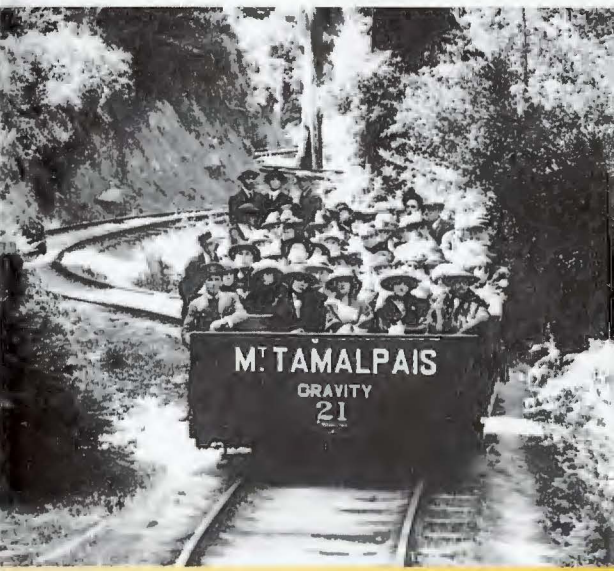
Gravity car on Mount Tam's Scenic Railway, ca. 1900