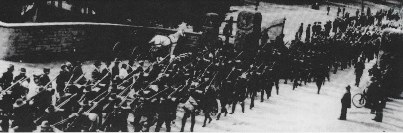
The 51st Iowa Volunteer Infantry Regiment marches through the Presidio's Lombard Street Gate in 1898, bound for Manila.