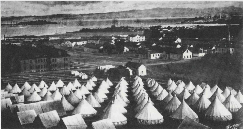
Tent camps were established on the Presidio to handle the thousands of soldiers preparing for transport to the Philippines, 1898.

Most Presidio troops got to the islands too late to fight the Spanish in the brief war. However Philippine rebels had been waging guerrilla warfare against Spanish colonialism long before the U.S. became involved. Their exiled leader, Emilio Aquinaldo, quickly made contact with the attacking force already on its way to the Philippines, in the belief that the United States would help the "Insurrectos" gain independence from Spain. But expansionists in the U.S. government had other plans. After the signing of the Treaty of Paris, on December 10, 1898, which ended the war against Spain, the United States opted to give Cuba its independence but keep the Philippines, to the dismay of the Philippine nationalists.