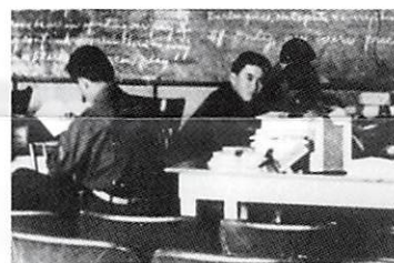
NATIONAL JAPANESE AMERICAN HISTORICAL SOCIETY

In 1962, the Department of the Interior designated the Presidio a National Historic Landmark, officially recognizing more than 500 buildings of historic value.