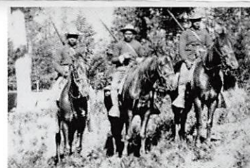
NPS, YOSEMITE RESEARCH LIBRARY

The Presidio expanded again in the 1920s when Crissy Army Airfield was built to augment harbor defense. When the Golden Gate Bridge was completed in 1937, the airfield moved to more spacious quarters to the north.