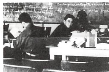
NATIONAL JAPANESE AMERICAN HISTORICAL SOCIETY

In 1962, the Department of the Interior designated the Presidio a National Historic Landmark, officially recognizing more than 500 buildings of historic value.