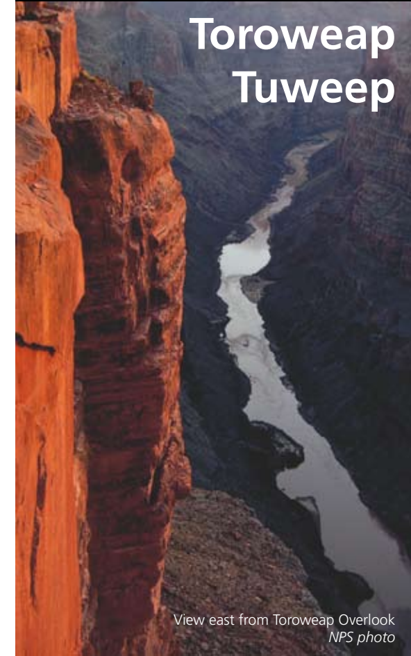
View east from Toroweap Overlook

The view from Toroweap Overlook, 3,000 vertical feet (880 m) above the Colorado River, is breathtaking; the sheer drop, dramatic! The volcanic features, cinder cones and lava flows, which make this viewpoint unique within Grand Canyon National Park, are equally impressive. Lava Falls, one of the river's most challenging rapids, is just downstream, easily seen and heard from the overlook.