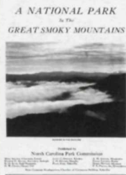
Thousands of pamphlets, journals, photographs, and reports chronicle the history of the National Park.