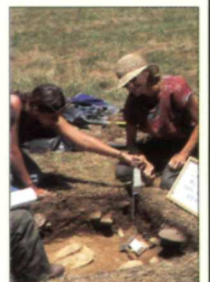
Volunteers and National Park Service staff conduct archeological work in the Cataloochee Valley.

Ethnographic resources in Great Smoky Mountains National Park include an extensive oral history collection. These life histories comprise both audio and video recorded interviews of former residents, early Park employees, and former Civilian Conservation Corps enrollees. These reminders of our past are the products of a long-established program of collecting oral traditions. Still, there is a critical need for ethnographic research related to the Cherokee, as well as the African-American slave and free families who once resided here.