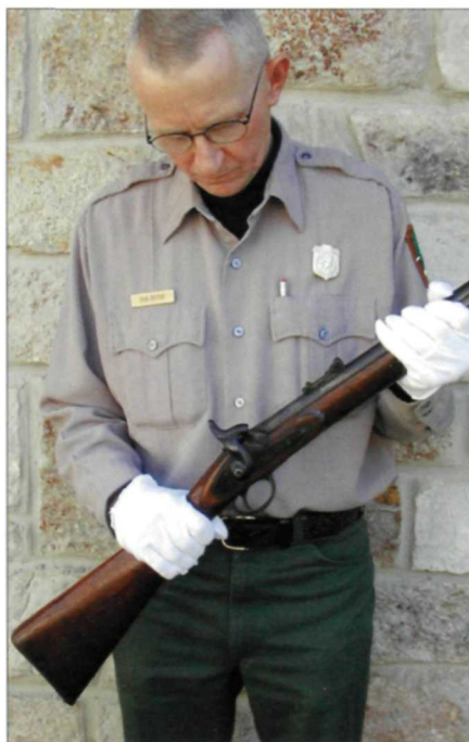
Artifacts of life in the Smokies include quilts, tools, household utensils, and firearms.