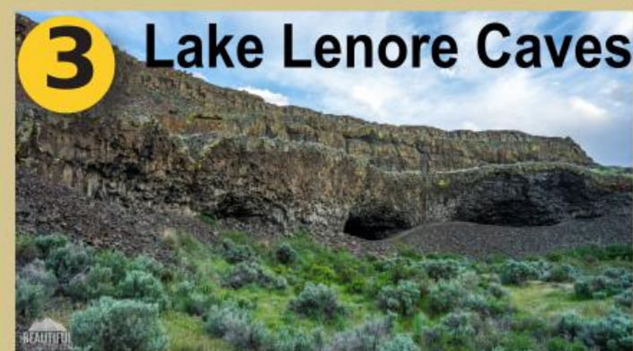
3 Lake Lenore Caves

Grand Coulee is possibly the most iconic feature associated with the Ice Age Floods, stretching about sixty miles southwest from Grand Coulee Dam to Soap Lake, WA. The bedrock is mainly Columbia River Basalt except at the northern end of the Upper Grand Coulee where underlying granite is exposed. Tectonic stresses during and after emplacement of the Columbia River Basalt produced a step-like monoclinial fold along the coulee's west boundary that uplifted the Waterville Plateau to the west over 1,300 feet.