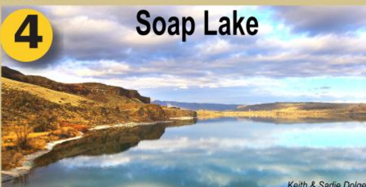
4 Soap Lake

As wide and deep as the Grand Coulee is, it was insufficient to hold the entire Missoula floodwaters discharge. A continuous water surface, extending locally as wide as 15 miles across the entire flood complex, sent water down similar, but smaller, parallel coulees to the east and created spectacular loess (wind blown soils) islands, butte and basin scabland, and cataract-canyons that make the Grand Coulee one of the most interesting sections of the Channeled Scabland.