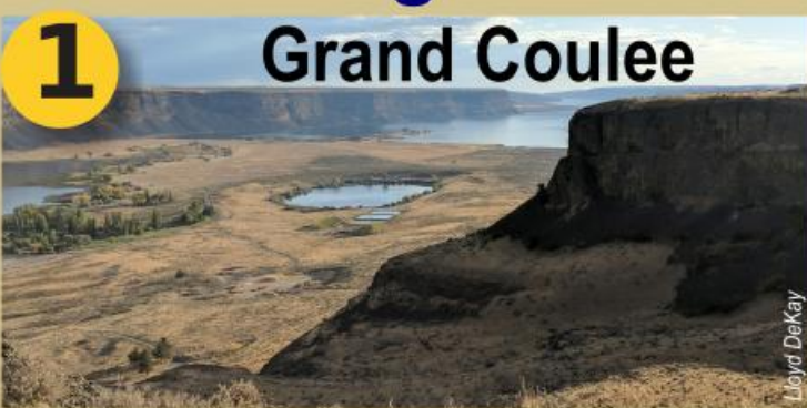
1 Grand Coulee