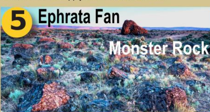
5 Ephrata Fan

The mineral rich waters of Soap Lake are thought to have medicinal and therapeutic qualities. Native Americans have been using the Soap Lake area for millennia, and starting in the early 1900's spa resorts developed where thousands of tourists came annually to drink, bathe, and apply the mineral rich muds.