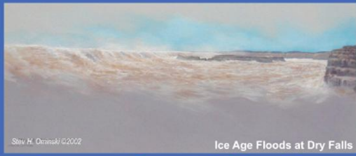
Ice Age Floods at Dry Falls