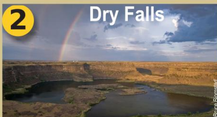
2 Dry Falls