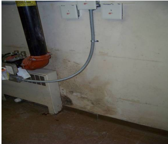
Water damage and mold in the Library

Maintaining appropriate and consistent temperature and humidity conditions is essential in conserving museum artifacts. Too high a temperature or too low a humidity level can result