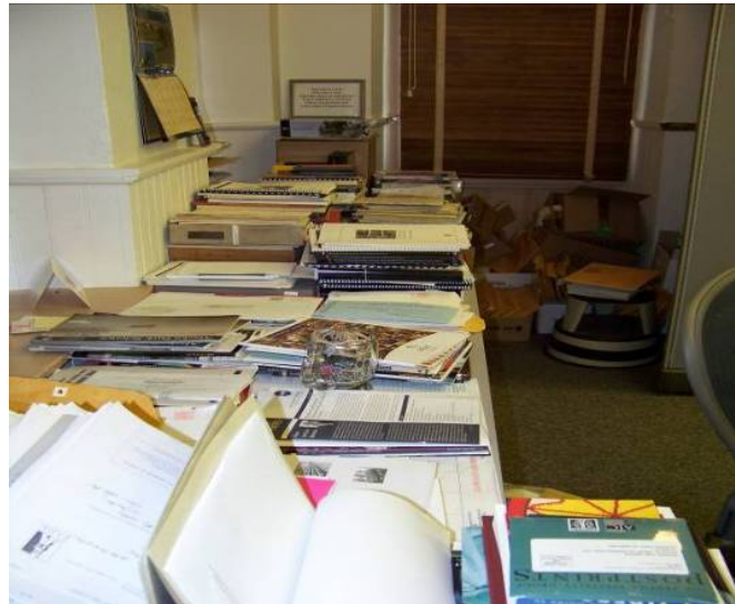
Overcrowded Library work environment OIG staff photo

The Collection stored at the Anthony Library needs a more secure and environmentally sound facility. If a permanent move cannot be made quickly, the Willow Springs facility offers an interim solution. The NPS “Park Museum Collection Storage Plan” recommends that the NPS History Collection be consolidated at the Willow Springs facility but provides no date for action. Movement to the Willow Springs facility would require additional space at that facility since the current storage area at Willow Springs is already overcrowded.