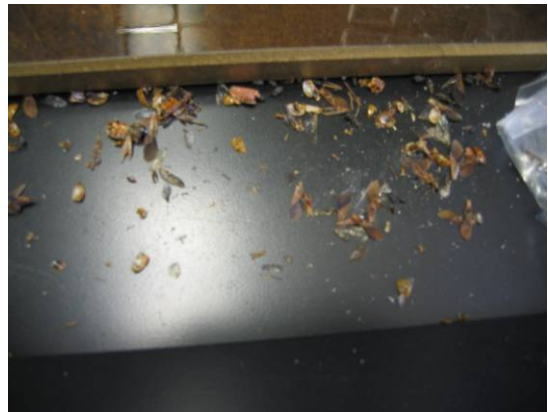
Dead insects line Library window sills

We saw remnants of a rodent nest in a drawer containing maps and insect bodies lining window sills. Though we could not know how current the insect infestation actually is, we saw that sticky traps had not been changed in quite some time. There were no records of regular, recurring trap monitoring, which is necessary to assess the degree of any infestation.