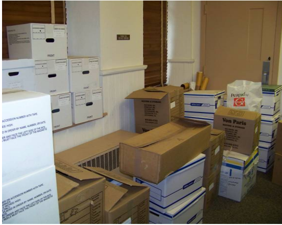
Blocked windows and vents at the Library

Overcrowded and unorganized storage. The state of storage at the Anthony Library hinders the ability of Center personnel to manage and retrieve items in the Collection, making usability of the Collection difficult.