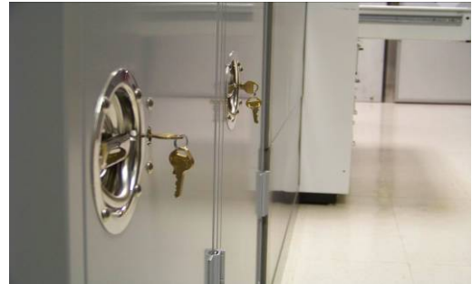
Unsecured storage cabinets

These security issues are especially troublesome because between 25 and 30 visitors a month tour the cultural objects, with up to 15 visitors in a single group. In addition, researchers and others access the photo archives. In these circumstances, visitors could easily remove artifacts.