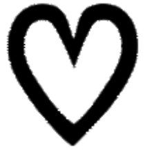
Patience & tolerance