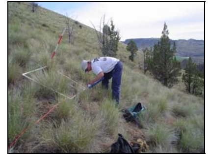
Bunchgrass-dominated steppe at JODA, 2008