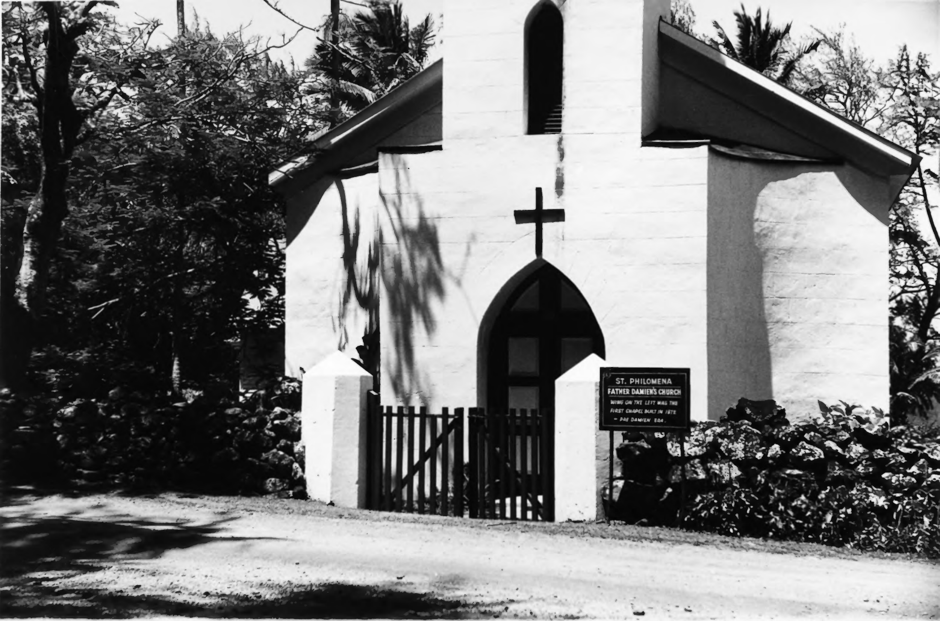
ST. PHILOMENA FATHER DAMIEN'S CHURCH WING ON THE LEFT WAS THE FIRST CHURCH BUILT IN 1878 - FATHER DAMIEN, O.S.A.