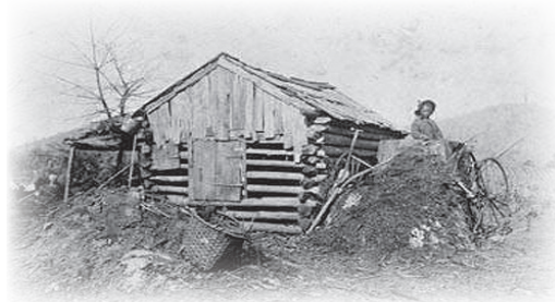
Female slave at a corn crib, Cobb County, Georgia, 1860

Cobb County's slave population grew 900% between 1838 and 1860. But slaves were expensive – the average slave cost $1,000 in 1860, not counting food, clothing, shelter, and medicine; therefore, only the wealthiest families became slaveowners. Since the quality of the soil in Northwest Georgia prohibited the widespread growth of cotton, a labor-intensive crop, slavery did not flourish here like it did in some central and southern Georgia counties, where the black population soon exceeded the white population. Slaves comprised 27% of the 18,074 people who lived in Cobb County in 1860.