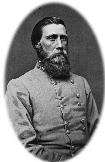
General John Bell Hood commanded Confederate forces at the Battle of Kolb’s Farm, June 27, 1864.