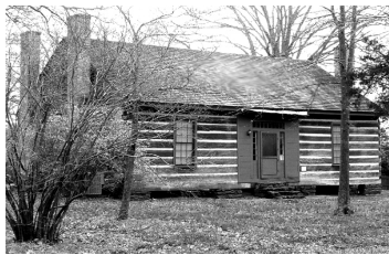
Kolb Farmhouse, post-restoration

One of the most-visited features of Kennesaw Mountain National Battlefield Park is the Kolb farmhouse. Since the National Park Service acquired the property in 1941, its exterior has been completely restored to its original wartime appearance. Today, the house is a private residence, and its interior is not accessible to the public.