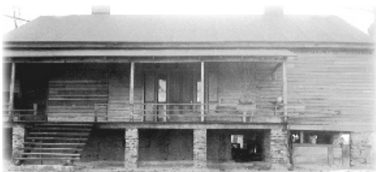
A front view of the Appling House as it appeared in 1939

The Appling house and its outbuildings, still standing as of 1941, were considered for inclusion in an early interpretation program by Kennesaw Mountain National Battlefield Park. However, the plan was rejected in order to direct funds toward the restoration of the Kolb farmhouse instead.