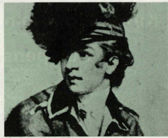
COL. BANASTRE TARLETON