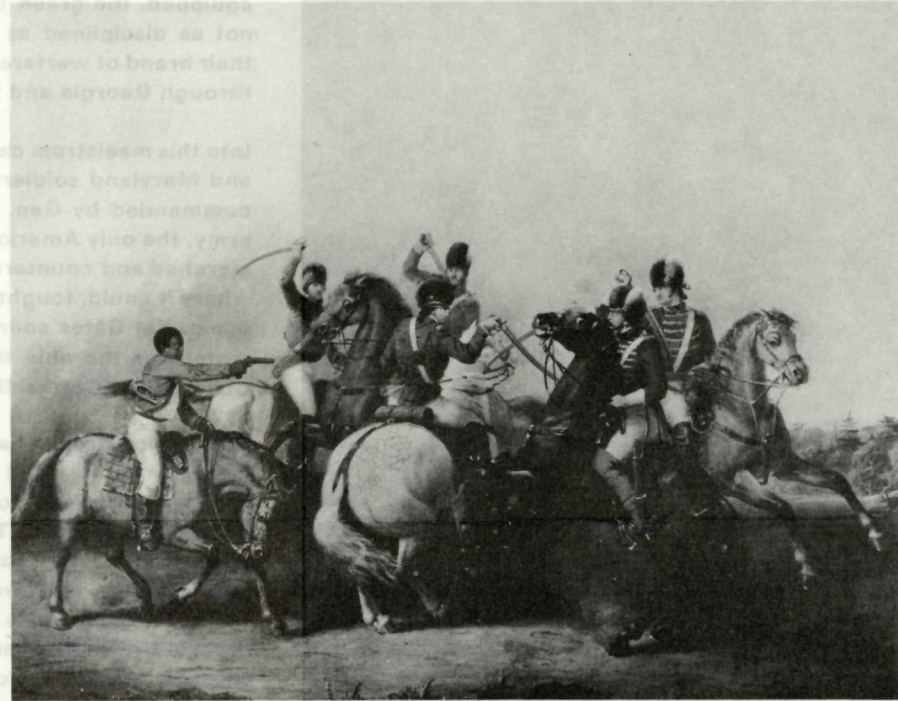
PAINTING OF THE BATTLE OF COWPENS BY WILLIAM RANNEY.