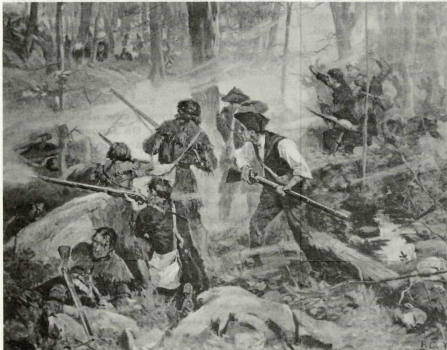
PAINTING OF THE BATTLE OF KINGS MOUNTAIN BY F. C. YOHN.