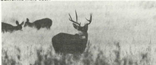
California mule deer.

Numbers of California mule deer may be seen in winter when the herd migrates from the Medicine Lake Highlands south of the park. Please drive carefully so you don't hit the wild animals that cross park roads both day and night.