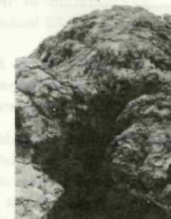
A lava chimney.