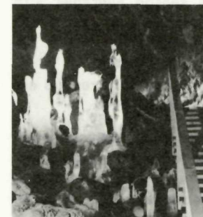
Indian Well Cave.