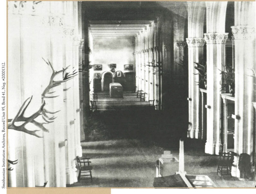
The conspicuous antlers in the interior of the Smithsonian Institution building (c. 1860s) seem to testify to the chivalrous conquest of the North American continent.

For American Indians, antler head-dresses and hundreds of other faunal to-tems were pieces of a larger body of myth, legend, and folk tale—an entire cosmography. This cosmography defined the history of each animal, its usefulness and relationship to humans, and the place of humans in the universe. Together with myths that inscribed tribal geography, faunal totems affirmed tribal cosmography, identified tribal members as a group, and attached them to specific lands. In these processes, the hunter was