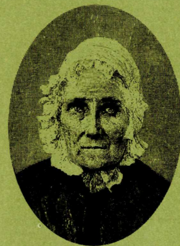
Sarah Bush Johnston Lincoln. 1788-1869

"There was absolutely nothing to excite ambition for education," he said later of his schooling in Indiana. Still, there emerged a love of reading and a curiosity for knowledge that lasted a lifetime. The Bible , Aesop's Fables , Pilgrim's Progress , Robinson Crusoe , Franklin's Autobiography , the classics of the day, were the books he mastered. The boy had a good memory and a ready wit. Laying aside his work, he would often entertain friends with jokes and imitations of politicians and preachers—the pillars of the community. And down the