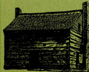
Little Pigeon Baptist Church

Piling all their goods into three wagons, the Lincoln family pulled slowly away from the homestead, picked up the road to Vincennes about 6½ kilometers (4 miles) north, and plodded steadily toward Illinois. On March 6 the caravan crossed the Wabash, and within the month they came to the north bank of the Sangamon River 13 kilometers (8 miles) west of Decatur. Abraham Lincoln, product of the Kentucky hills and Indiana forests, had reached the prairie country that would claim his next 30 years.