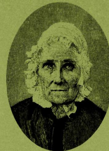
Sarah Bush Johnston Lincoln, 1788-1866

"There was absolutely nothing to excite ambition for education," he said later of his schooling in Indiana. Still, there emerged a love of reading and a curiosity for knowledge that lasted a lifetime. The Bible , Aesop's Fables , Pilgrim's Progress , Robinson Crusoe , Franklin's Autobiography , the classics of the day, were the books he mastered. The boy had a good memory and a ready wit. Laying aside his work, he would often entertain friends with jokes and imitations of politicians and preachers—the pillars of the community. And down the