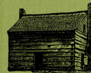
Little Pigeon Baptist Church

Piling all their goods into three wagons, the Lincoln family pulled slowly away from the homestead, picked up the road to Vincennes about 6½ kilometers (4 miles) north, and plodded steadily toward Illinois. On March 6 the caravan crossed the Wabash, and within the month they came to the north bank of the Sangamon River 13 kilometers (8 miles) west of Decatur. Abraham Lincoln, product of the Kentucky hills and Indiana forests, had reached the prairie country that would claim his next 30 years.