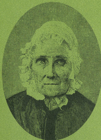
Sarah Bush Johnston Lincoln, 1788-1869

"There was absolutely nothing to excite ambition for education," he said later of his schooling in Indiana. Still, there emerged a love of reading and a curiosity for knowledge that lasted a lifetime. The Bible , Aesop's Fables , Pilgrim's Progress , Robinson Crusoe , Franklin's Autobiography , the classics of the day, were the books he mastered. The boy had a good memory and a ready wit. Laying aside his work, he would often entertain friends with jokes and imitations of politicians and preachers—the pillars of the community. And down the