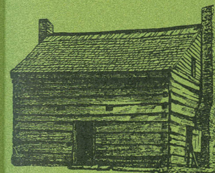
Little Pigeon Baptist Church

Piling all their goods into three wagons, the Lincoln family pulled slowly away from the homestead, picked up the road to Vincennes about 6½ kilometers (4 miles) north, and plodded steadily toward Illinois. On March 6 the caravan crossed the Wabash, and within the month they came to the north bank of the Sangamon River 13 kilometers (8 miles) west of Decatur. Abraham Lincoln, product of the Kentucky hills and Indiana forests, had reached the prairie country that would claim his next 30 years.