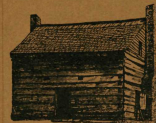
Little Pigeon Baptist Church

Piling all their goods into three wagons, the Lincoln family pulled slowly away from the homestead, picked up the road to Vincennes about 6½ kilometers (4 miles) north, and plodded steadily toward Illinois. On March 6 the caravan crossed the Wabash, and within the month they came to the north bank of the Sangamon River 13 kilometers (8 miles) west of Decatur. Abraham Lincoln, product of the Kentucky hills and Indiana forests, had reached the prairie country that would claim his next 30 years.