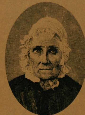
Sarah Bush Johnston Lincoln, 1788-1869

"There was absolutely nothing to excite ambition for education," he said later of his schooling in Indiana. Still, there emerged a love of reading and a curiosity for knowledge that lasted a lifetime. The Bible, Aesop's Fables, Pilgrim's Progress, Robinson Crusoe, Franklin's Autobiography , the classics of the day, were the books he mastered. The boy had a good memory and a ready wit. Laying aside his work, he would often entertain friends with jokes and imitations of politicians and preachers—the pillars of the community. And down the