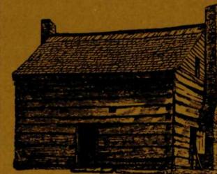
Little Pigeon Baptist Church

Piling all their goods into three wagons, the Lincoln family pulled slowly away from the homestead, picked up the road to Vincennes about 6½ kilometers (4 miles) north, and plodded steadily toward Illinois. On March 6 the caravan crossed the Wabash, and within the month they came to the north bank of the Sangamon River 13 kilometers (8 miles) west of Decatur. Abraham Lincoln, product of the Kentucky hills and Indiana forests, had reached the prairie country that would claim his next 30 years.