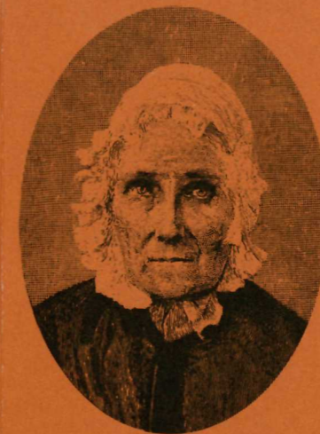
Sarah Bush Johnston Lincoln, 1788-1869

"There was absolutely nothing to excite ambition for education," he said later of his schooling in Indiana. Still, there emerged a love of reading and a curiosity for knowledge that lasted a lifetime. The Bible , Aesop's Fables , Pilgrim's Progress , Robinson Crusoe , Franklin's Autobiography , the classics of the day, were the books he mastered. The boy had a good memory and a ready wit. Laying aside his work, he would often entertain friends with jokes and imitations of politicians and preachers—the pillars of the community. And down the