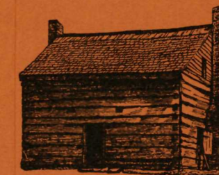
Little Pigeon Baptist Church

Piling all their goods into three wagons, the Lincoln family pulled slowly away from the homestead, picked up the road to Vincennes about 6½ kilometers (4 miles) north, and plodded steadily toward Illinois. On March 6 the caravan crossed the Wabash, and within the month they came to the north bank of the Sangamon River 13 kilometers (8 miles) west of Decatur. Abraham Lincoln, product of the Kentucky hills and Indiana forests, had reached the prairie country that would claim his next 30 years.