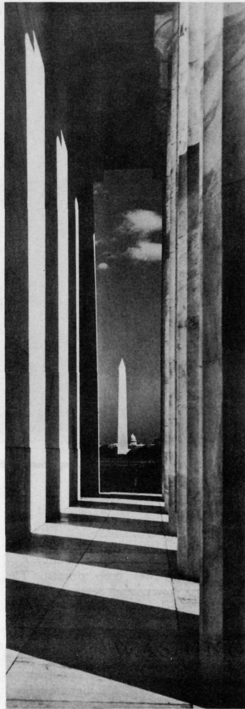
Washington Monument and Capitol from south colonnade of Lincoln Memorial

The Lincoln Memorial is administered by the National Capital Parks for the National Park Service, Department of the Interior. All inquiries should be addressed to the Superintendent, National Capital Parks, Washington, D. C. This national memorial is open daily from 9 a. m. to 9:30 p. m., closing only on Christmas Day.