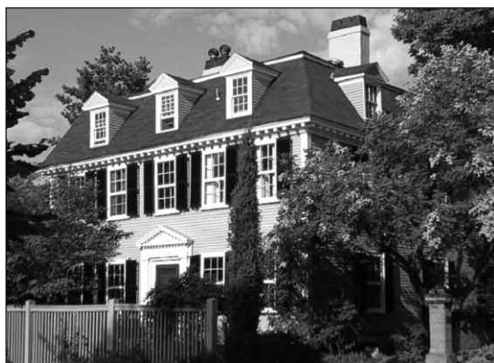
Henry Vassall House, 94 Brattle Street, Cambridge