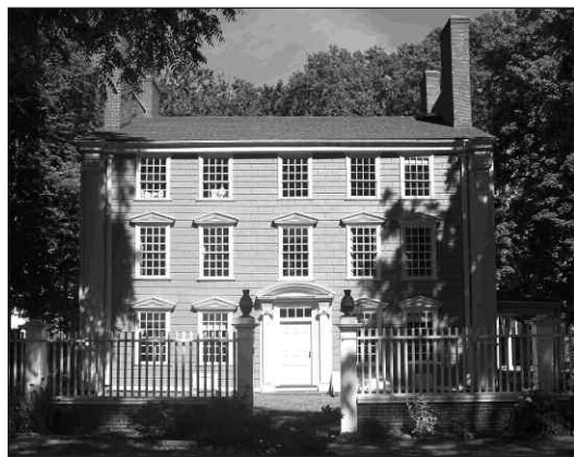
Royall House, Medford, with facade remodeled in 1747