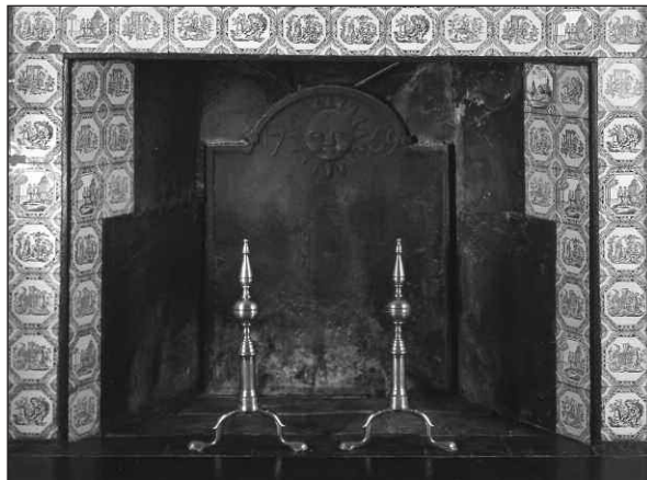
Iron fireback in the second floor bedroom, showing date of 1759