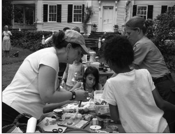
Family Day art projects on the front lawn, September 2008

The Longfellow museum staff have pored over hundreds of family photographs and transcribed homespun newspapers and