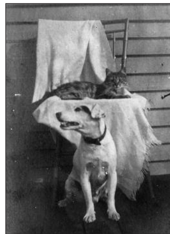
Tippy the dog & Tyler the cat, c. 1896-1902.