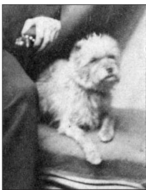
Trap, a small Scotch Terrier, 1864