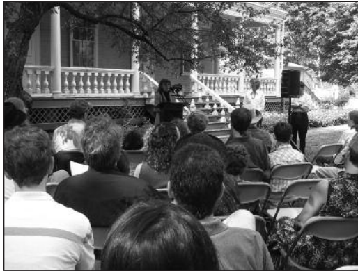
Young poets award ceremony, 2008