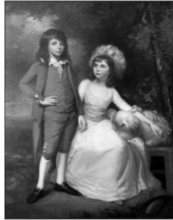
Mather Brown’s painting in the Longfellow House parlor

in memory of Jack the dog under the magnificent linden tree on the east lawn alongside the House. Chiseled into the flat gray marker are the words “Our Little Friend Jack, 1901-1914.” The Harvard students used the gravestone as a way to discuss with elementary-school children what pets mean to a family and what people might feel following such a loss.