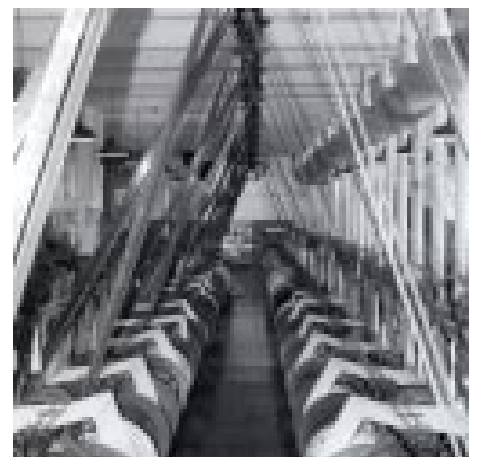
Weave room, Boott Cotton Mills Museum.

In a letter to a friend in 1846, Bagley promoted the labor-reform publication Factory Tracts as representing the interests of those "who are not willing to see our sex made into living machines to do the bidding of the incorporated aristocrats and reduced to a sum for their bodily services hardly sufficient to keep soul and body together." Although the struggles of Bagley and other mill girls to achieve legislation for a 10-hour day failed, Lowell's textile corporations did reduce the workday to 11 hours.