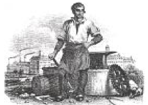
A 19th-century mechanic.

The appearance of the Suffolk Mills changed radically over its 100 years of operation as older buildings were replaced with newer ones. The most dramatic alterations occurred during the Civil War when the North and South severed the cotton trade. Realizing that