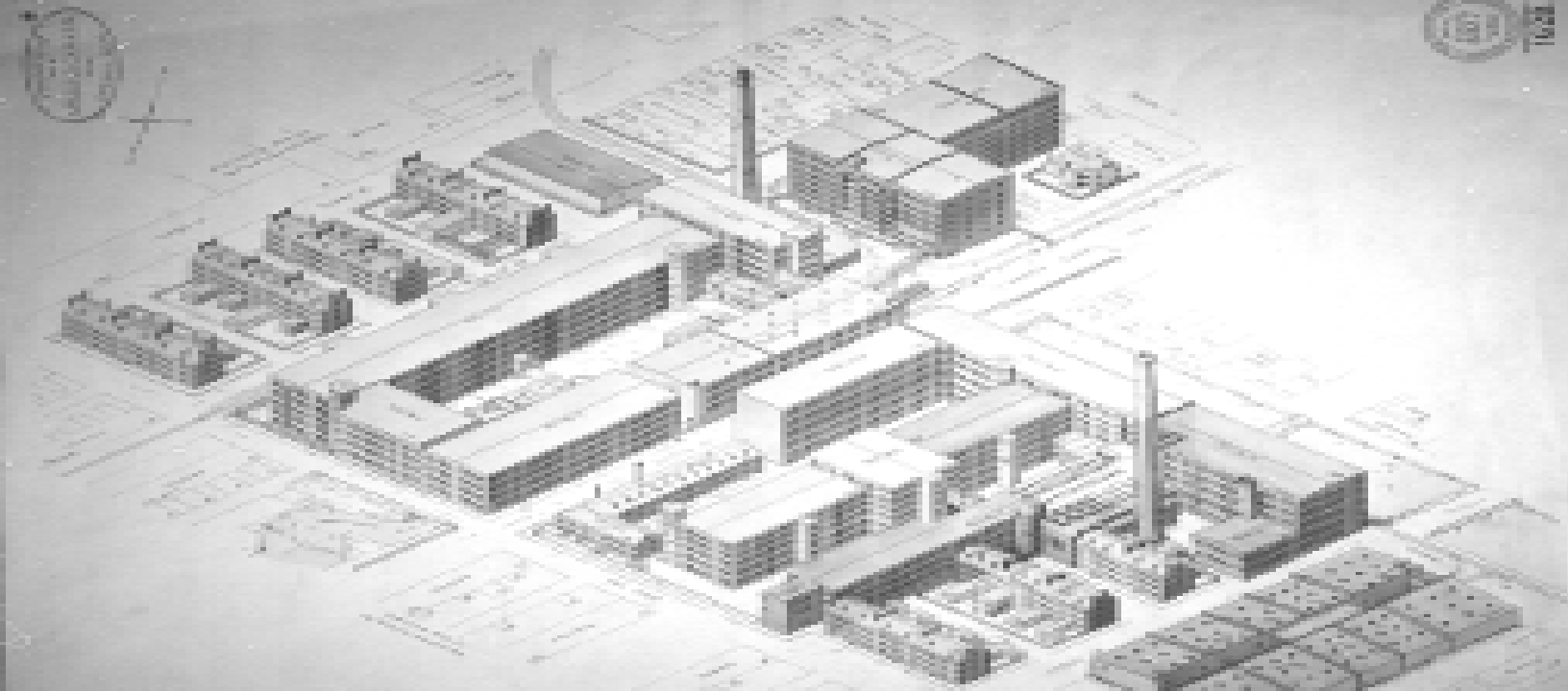
Tremont and Suffolk Mills, ca. 1896. Collection of Lowell NHP.

Lowell National Historical Park National Park Service U.S. Department of the Interior