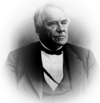
James B. Francis.