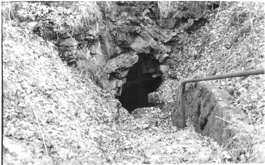
Colossal Cave Entrance (E-19) Mammoth Cave National Park, Kentucky