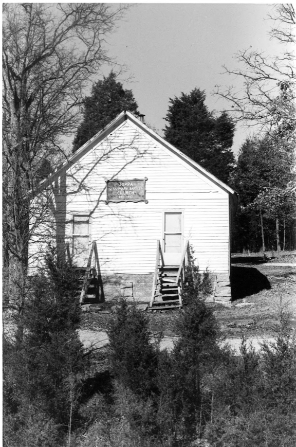
1. Joppa Baptist Church (T-40) Mammoth Cave National Park, Kentucky