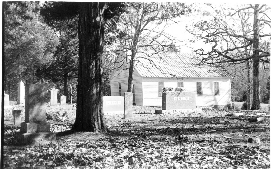
2. Joppa Baptist Church (T-40) and cemetery (C-16) Mammoth Cave National Park, Kentucky