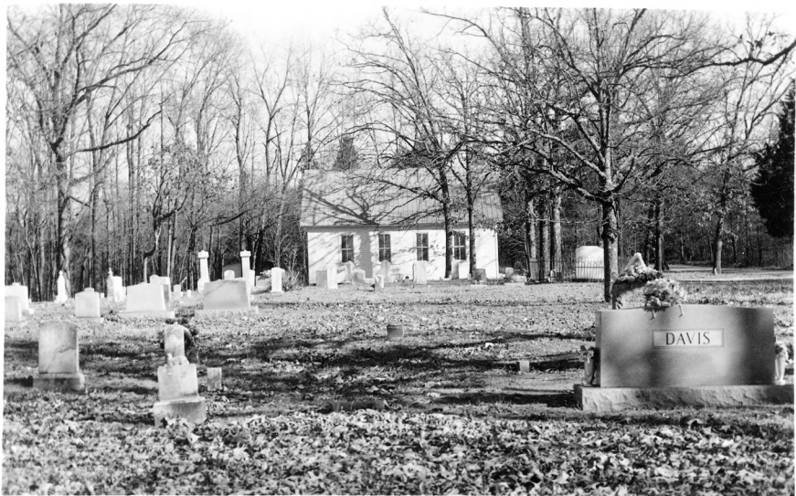
2. Mammoth Cave Baptist Church (LT-41) and Cemetery (C-44) Mammoth Cave National Park, Kentucky