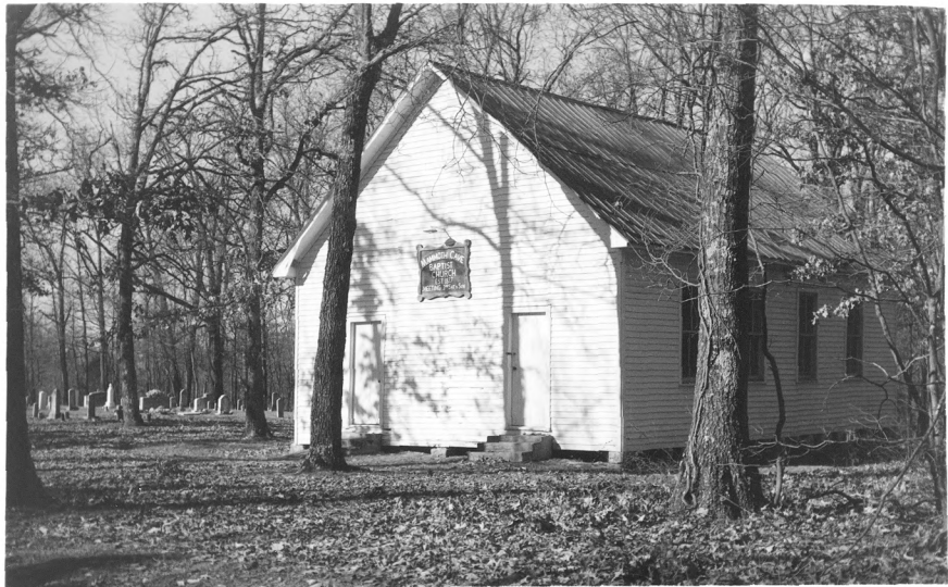
1. Mammoth Cave Baptist Church (T-41) Mammoth Cave National Park, Kentucky