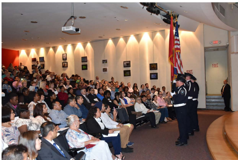
On June 16, We Welcomed 80 New United States Citizens at a Naturalization Ceremony in the AMSE Auditorium.