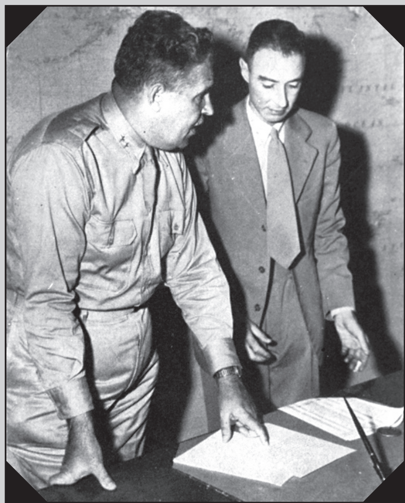
General Groves and Robert Oppenheimer