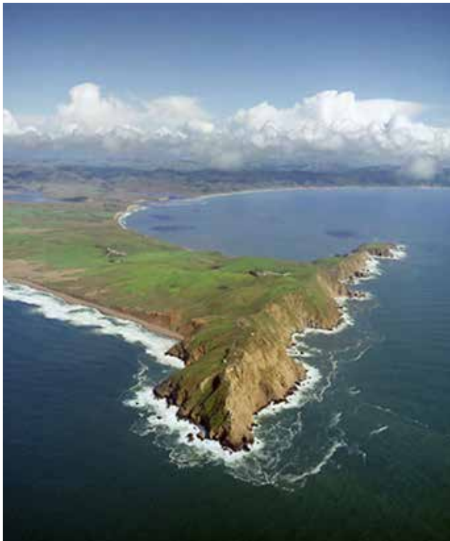
Drakes Bay Historic and Archaeological District, Point Reyes National Seashore, California. The district was designated a National Historic Landmark in 2012. It is directly associated with the earliest documented cross-cultural encounter between California Indians and Europeans, leaving the most complete material record on the West Coast. The nearly 6,000-acre district is part of the Gulf of the Farallones National Marine Sanctuary.

Daina Penkiunas Wisconsin State Historic Preservation Office