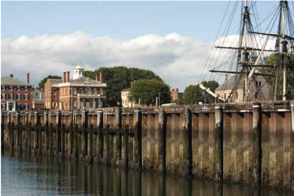
Salem Maritime National Historic Site, Salem, Massachusetts. Once more than 50 wharves extended into Salem Harbor. Three remain at the NPS historic site, which interprets colonial trade. Derby Wharf, built in 1806, is a half-mile long. The shorter Hatch's Wharf and Central Wharf were built in 1819 and 1791, respectively. The historic site includes some nine acres of land along the waterfront of Salem Harbor, including historic buildings, a replica of a tall ship, and the light station, built in 1871.