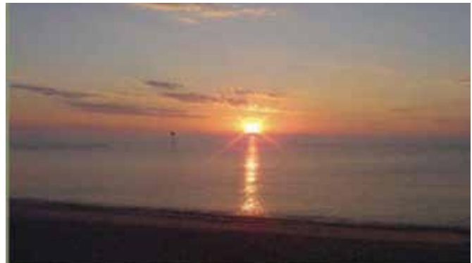
Figure 4: Channel Marker in Nantucket Sound; courtesy of NPS.

also as representatives of tribes across the nation. While you may see a channel marker, beyond that, really what you see is entirely natural. It is the belief-based association with the very natural maritime landscape that makes Nantucket significant for the tribes. People may ask, how is it a "landscape? It's really all water?" For the purposes of eligibility for the Register, districts that are significant landscapes often include bodies of water, large or small—some call them (informally) "riverscapes," "lakescapes," or "seascapes"—and a cultural landscape district can include anything that has to do with a broad natural expanse with natural features that may relate historically to a group or groups of people, including water.