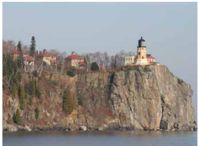
Split Rock Light Station, Town of Beaver Bay, Lake County, Minnesota. Built in 1909-1910 as part of a concerted effort to upgrade the Great Lakes navigation system, the Split Rock Light Station served the ports of Two Harbors and Duluth-Superior. From these ports, tons of iron ore were shipped to eastern industrial states and grain was shipped throughout the Great Lakes. The light station and associated buildings were designated a National Historic Landmark in 2011.