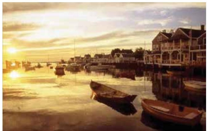
Figure 2: Sunset over Nantucket; courtesy of NPS.

The image in Figure 2 provides a view of Gay Head, which is a National Natural Landmark. It is on the southwestern end of Martha’s Vineyard. It is the point central for the Wampanoag tribe of Gay Head. Gay Head, traditionally, is where Moshup settled when he finally made that movement off of Cape Cod and down into Martha’s