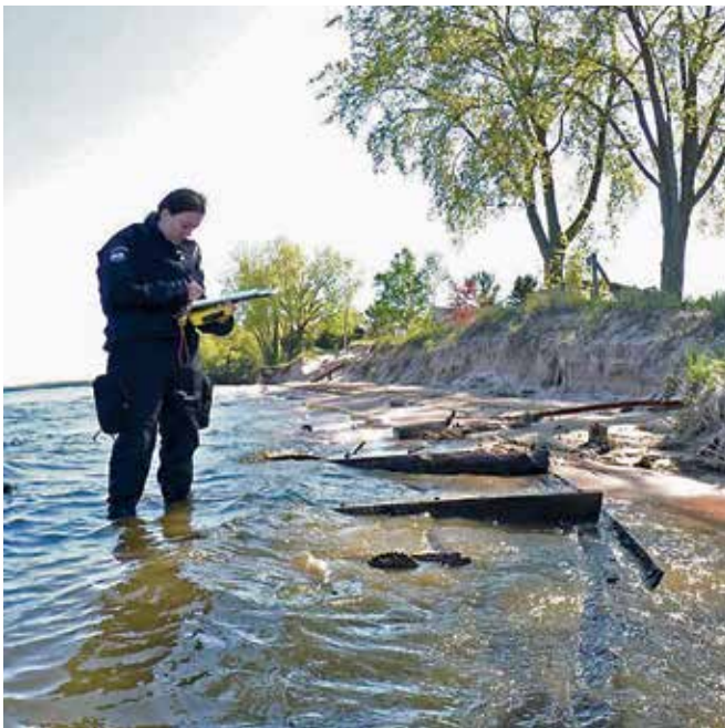
Jacksonport Wharf Archaeological District, Door County, Wisconsin. Today, during periods of calm water, the Reynolds Pier pilings can be seen protruding from the water's surface. In the image at the left, an archaeologist is recording observations.

We have also taken the initiative to revise all of our outreach in the Historical Society, to try to bind things together and to take individual isolated things that we are doing, pull them all together, and promote them jointly so during this next couple