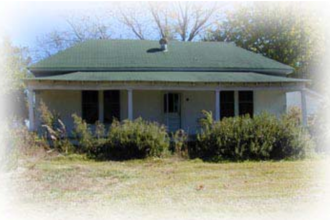
Bailey farm primary residence located in Hinds County, Mississippi

On Thursday, January 9, 2003, the U.S. Department of Agriculture's Farm Service Agency transferred ownership of the 470-acre Bailey farm in Hinds County, Mississippi, to the National Park Service. The property includes the site of the former Dillon plantation which served as temporary headquarters of Union Generals Ulysses S. Grant, William Tecumseh Sherman, and John A. McClernand during the Civil War. The entire Bailey farm is eligible for inclusion in the National Register of Historic Places because of its association with the Civil War's Battle of Raymond, Battle of Jackson, and Siege of Vicksburg.